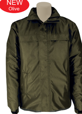
AS10690 - JACKET WR WARM QUILTED PADDED LINING AND FOLD-IN HOOD OLIVE - from R611.00 R569.00 BOTTLE GREEN (limited sizes) - from R611.00 R299.00 Fabric: Oxford Nylon WP / Size: S - 2XL