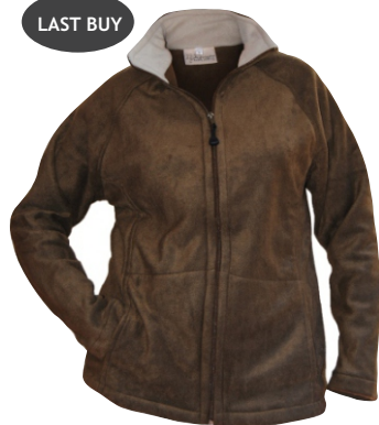
LADIES PF TOP, RAGLAN SLEEVE, PKTS, INNER COLLAR AS1008CM - CHOCOLATE / MUSHROOM - AS1008ST - STONE - from R322.30 R289.00 Fabric: Normal Polar Fleece / Size: S - 2XL