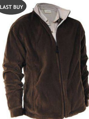
UNISEX POLAR FLEECE TOP WITH POCKETS AS283CM - CHOCOLATE / MUSHROOM from R325.40 R299.00 Fabric: Normal Polar Fleece Size: XS - 3XL