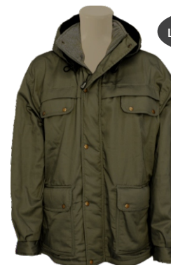
AS395OL-210 - PARKA JACKET WITH POLAR FLEECE LINING AND FOUR POCKETS OLIVE - from R1130.62 R999.00 Fabric: 210g Polycotton Twill Size: S - 3XL