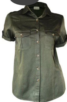
SAS735-145-OL LADIES SHORT SLEEVE 100% LIGHT WEIGHT 145GM COTTON TWILL OLIVE - from R189.00