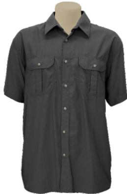
MENS BUSH SHIRT WITH FLAP POCKETS Size: S - 3XL

AS047 - from R344.18 R289.00 SHORT SLEEVES