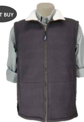
SHERPA FLEECE UNISEX SLEEVELESS TOP AS283CSH - CHOCOLATE / STONE from R199.00 Size: S - 2XL