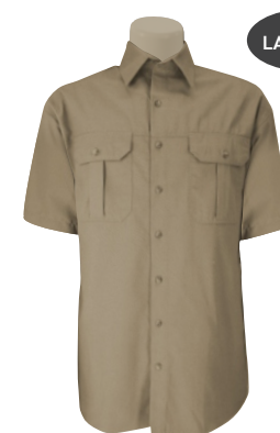
AS047KH-235 - R249.00 R189.00 SHORT SLEEVES

"CLASSIC ORIGINALS" MENS BUSH SHIRT KHAKI ONLY / 235g COTTON TWILL / Size: S - 3XL