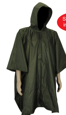
ASTMPONC - ADULTS PONCHO - DURABLE RUBBERISED AND WATERPROOF, IN A BAG CHOCOLATE, 89L X 140W - from R248.78 R229.00 Fabric: Nylon - S size: OSFA ASTMPONO - OLIVE - from R239.21 R229.00