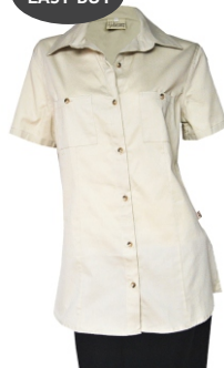
SAS150BN145-STONE LADIES SHORT SLEEVE 100% LIGHT WEIGHT 145GM COTTON TWILL STONE - from R189.00