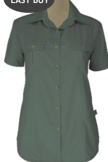
SAS150F02-TECH LADIES SHORT SLEEVE BUSH SHIRT, LIGHT WEIGHT TECHNICAL MATERIAL, DARK OLIVE - from R199.00