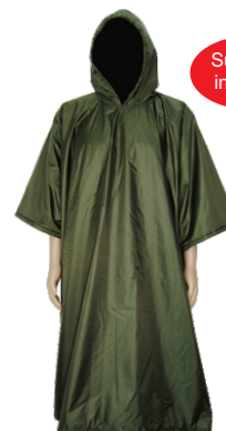
ASTMPLIO - ADULTS LINED PONCHO DURABLE - HEAVY RUBBERISED AND POLAR FLEECE LINED, IN A BAG, IN OLIVE 1,2M LONG - from R707.20 R669.00 Fabric: Nylon - S size: OSFA