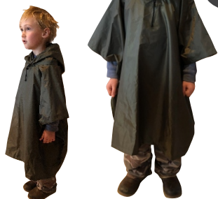
ASTMKIDPONO - KIDS PONCHO RUBBERISED AND WATERPROOF, OLIVE, 69L X 78W - from R209.00 R199.00 Fabric: Nylon - S size: OSFA