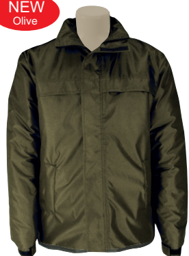
AS10690 - JACKET WR WARM QUILTED PADDED LINING AND FOLD-IN HOOD OLIVE - from R611.00 R569.00 BOTTLE GREEN (limited sizes) - from R611.00 R299.00 Fabric: Oxford Nylon WP Size: S - 2XL