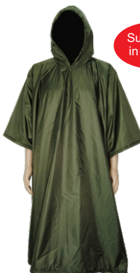
ASTMPLIO - ADULTS LINED PONCHO DURABLE - HEAVY RUBBERISED AND POLAR FLEECE LINED, IN A BAG, IN OLIVE 1,2M LONG - from R707.20 R669.00 Fabric: Nylon - Size: OSFA