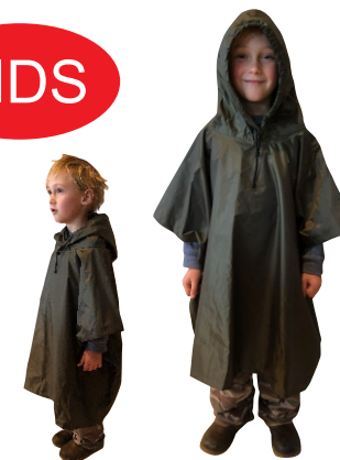
ASTMKIDPONO - KIDS PONCHO RUBBERISED AND WATERPROOF, OLIVE, 69L X 78W - from R209.00 R199.00 Fabric: Nylon - Size: OSFA