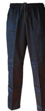
EP11 - BLACK - UNISEX BLACK ELASTICATED PANTS WITH PKTS - from R209.10 R199.00 Fabric: Polycotton Twill Size: S - 5XL