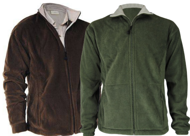
UNISEX POLAR FLEECE TOP WITH POCKETS AS283CM - CHOCOLATE / MUSHROOM - from R325.40 R299.00 AS283OS - OLIVE / STONE - from R325.40 R319.00 Fabric: Normal Polar Fleece Size: XS - 3XL