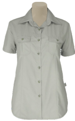
LADIES BUSH SHIRT SHAPED WITH FLAP POCKETS