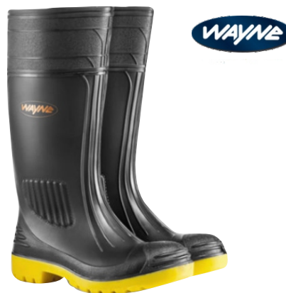
WAYNE MENS GUMBOOTS- WHITE EGOLI 1 KNEE LENGTH- AYWA-F1310 PVC upper • PVC Nitrile Sole • STC