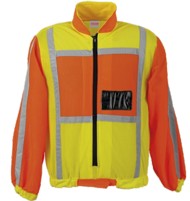
AXKVCON-LVEST REFLECTIVE L/SLEEVE VEST

Reflective tape, adjustable straps 120g 100% polyester