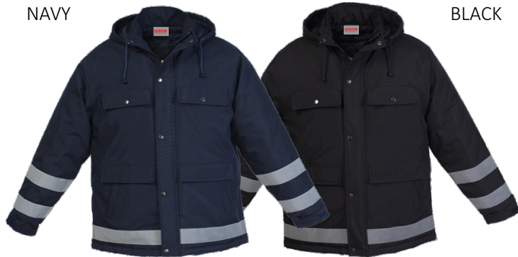
AXKVBFA-JAC PADDED JACKET

Zip-off padded hood, wind resistant robust jacket with quilted padding storm flap, front chest pockets with studs, two front pockets with double entry, adjustable velcro tabs on cuffs, reflective tape for high visibility