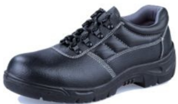
FRAMS CONTRACT SHOE AYFR8401-STC (IMPORTED)