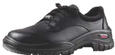
LADIES LEATHER LACE-UP SHOE AYS154001-STC