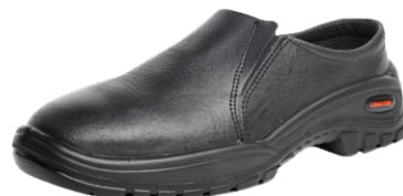
KITCHEN- LEMAITRE SLIPON AYBN8007-NSTC