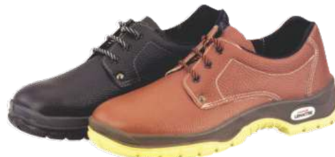
LEMAITRE QUALITY AYBN8102-STC