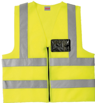
AXKVCON-WAIST WAISTCOAT VEST

ID chest pocket, reflective tape, full zip front, two-tone colourway, ISO 20471:2013 approved, 100g polyester mesh