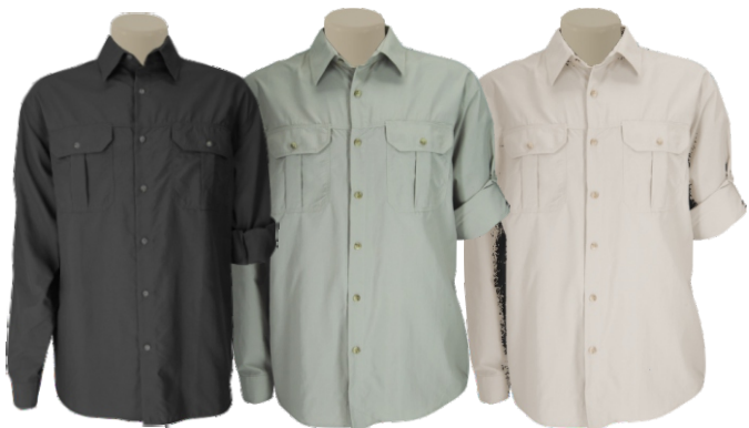
AT044 - MENS LONG SLEEVE 2 FLAP POCKET SHIRT WITH ROLLUP SLEEVE TABS

LIGHT TECHNICAL COOL BREATHABLE AND COLOURFAST NYLON 145GM 100% COTTON LIGHTWEIGHT TWILL 120GM POLYCOTTON SHIRTING