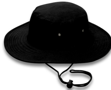
AXCYCRICKET CRICKET HAT WITH CORD AND SLIDE TOGGLE