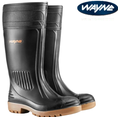
WAYNE MENS GUMBOOTS- WHITE EGOLI 1 KNEE LENGTH- AYWA-F1260 PVC upper • PVC Nitrile Sole • without STC