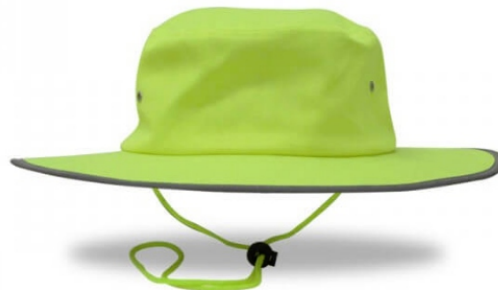
AXCYVISION REFLECTIVE POLYESTER HAT