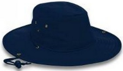
AXCYBUSHHAT BUSH HAT WITH SIDE STUDS AND NECK CORD