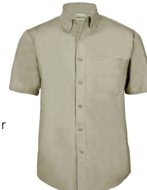
AT370SS - MENS CLASSIC LOUNGE SHIRT SHORT SLEEVE

LIGHT TECHNICAL COOL BREATHABLE AND COLOURFAST NYLON 145GM 100% COTTON LIGHTWEIGHT TWILL 120GM POLYCOTTON SHIRTING