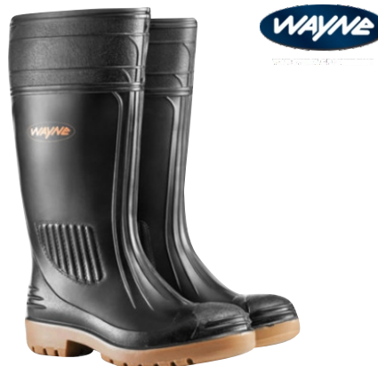
WAYNE MENS GUMBOOTS- WHITE EGOLI 1 KNEE LENGTH- AYWA-F1270 PVC upper • PVC Nitrile Sole • STC