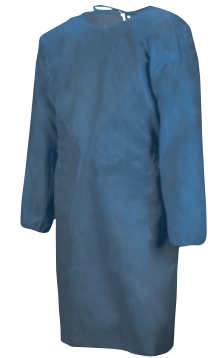
AXBEDISSURG DISPOSABLE SURGEONS GOWN LONG SLEEVES OR AXBEDISPGOWN WITH 3/4 SLEEVES