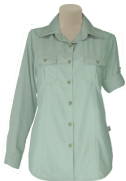
AT150 - LADIES 2 FLAP POCKET SHAPED SHIRT, LONG SLEEVES WITH ROLLUP SLEEVE TABS

LIGHT TECHNICAL COOL BREATHABLE AND COLOURFAST NYLON 145GM 100% COTTON LIGHTWEIGHT TWILL 120GM POLYCOTTON SHIRTING