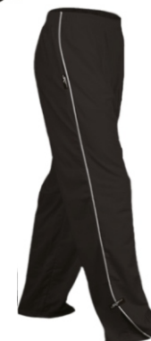
TRACKSUIT AXKVBRT303 100g Micro rip-stop 100% Polyester fabric