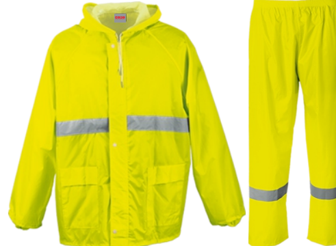
AXKVCON-RR CONTRACT REFLECTIVE RAIN SUIT

Rain jacket with two front patch pockets, elasticated cuffs and storm flap, reflective tape across torso, back and knees, trousers have an elasticated waist and double top-stitching throughout, heat sealed seams