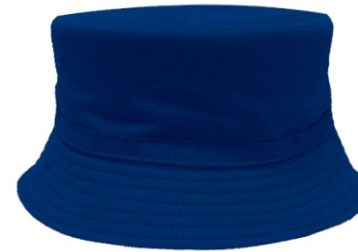
AXCYPHO BUCKET HAT PLAIN