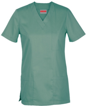
AXKVSC-LCT LADIES SCRUB TOP 180G POLYCOTTON