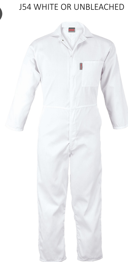
J54 WHITE OR UNBLEACHED

Button-through front, thigh length, an industry standard for lab, warehouse, workshop and general maintenance application, single chest and two front pockets, durable self-colour plastic buttons for non-scratch wear, 190g polycotton twill fabric