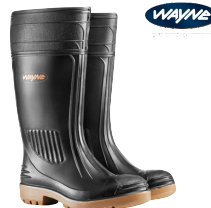
WAYNE MENS GUMBOOTS- BLACK EGOLI 1 KNEE LENGTH- AYWA-F1280 PVC upper • PVC Nitrile Sole • STC & Midsole