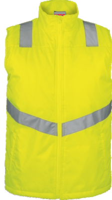
AXKVSTN-JAC P/FLEECE BODYWARMER

Knitted rib collar, printed reflective detail on sleeves, grown on placket, shoulder panel with reflective piping, twin needle cover seam hem, two-tone body with reflective tape on front and back, 170g 100% polyester with moisture management