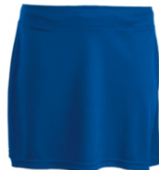
LADIES SPORTS TOP AND SKIRT AXKVBRT381 120g 100% Polyester Lightweight fabric with moisture management finish