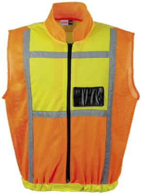
AXKVCON-SVEST REFLECTIVE S/LESS VEST

ID chest pocket, reflective tape, full zip front, two-tone colourway, ISO 20471:2013 approved, 100g polyester mesh