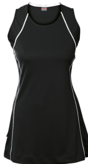
LADIES SPORTS DRESS AXKVBRT371 120g 100% Polyester with moisture management