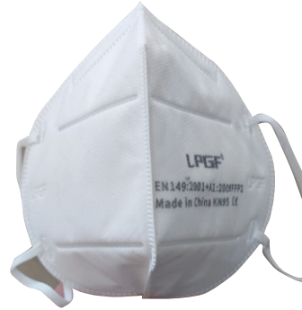
AXBEN95MASK DISPOSABLE MEDICAL FACE MASKS N95 CE CERTIFIED 500 + UNITS