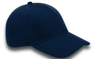
AXCY6PANWORK 6 PANEL DURABLE WORKWEAR CAP