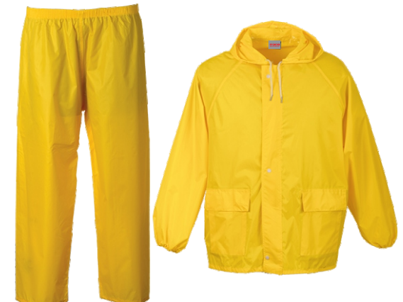
AXKVCON-R CONTRACT RAIN SUIT PLAIN

Flannel lined with concealed hood and reflective tape Raglan sleeves