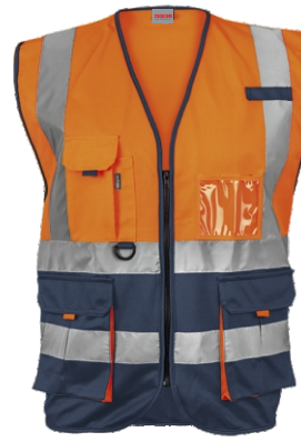
AXKVWC-SIG 2 TONE VEST

Side welt pockets, safety bodywarmer with reflective detail, fully padded and fully lined, front inverted nylon zip with chin guard, high-low hem line, 100% polyester outer fabric, tonal stretch binding at armholes