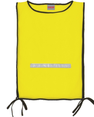
AXKV-B-BAS SAFETY BIB

Two tone utility style waistcoat, shoulder and waist reflective tape, cell phone and pen pocket, ID pocket with Velcro closure, lower bellow pockets, contrast binding at armholes and neckline, 120g 100% polyester fabric