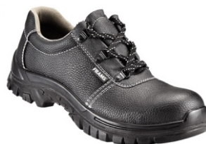
FRAMS QUALITY SHOE AYFR2941-STC