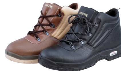
LEMAITRE QUALITY AYBN8011-STC