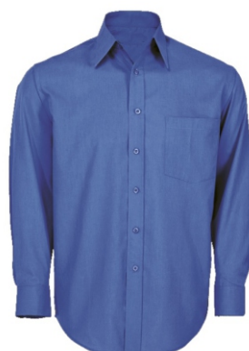
AT370LS - MENS CLASSIC LOUNGE SHIRT LONG SLEEVE

LIGHT TECHNICAL COOL BREATHABLE AND COLOURFAST NYLON 145GM 100% COTTON LIGHTWEIGHT TWILL 120GM POLYCOTTON SHIRTING