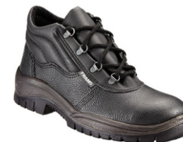
FRAMS QUALITY BOOT AYFR4911-STC