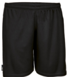
SOCCKER KITS SHORTS AND SHIRT AXKVBRT379 100% Polyester X-tech superior quick dry moisture management fabric