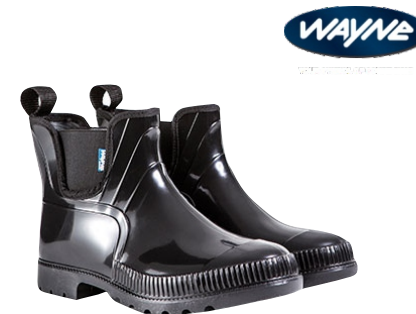
WAYNE MENS DURALIGHT GUMBOOTS- BLACK AYWA1504 PVC upper • PVC Sole • without STC