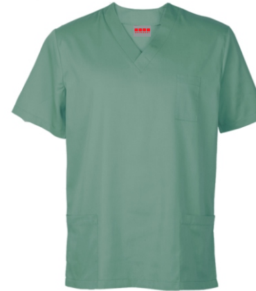
AXKVSC-MCT MENS SCRUB TOP 180G POLYCOTTON