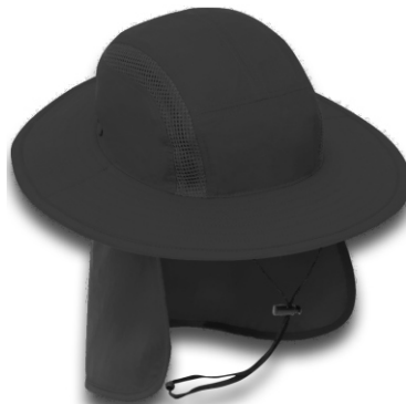
AXCYWEATHER 6 PANEL CROWN MICROFABRE HAT