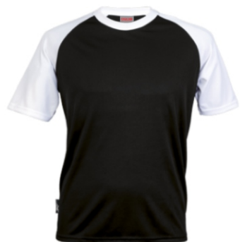
SOCCKER KITS SHORTS AND SHIRT AXKVBRT429 135g 100% Polyester fabric with moisture management