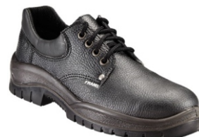
FRAMS QUALITY SHOE AYFR2911-STC