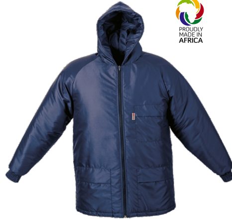
AXBEFREEJKT FREEZER JACKET

Hood with draw cord, insulated padded jacket with elasticated cuffs, two front pockets, one chest pocket, invisible zip for embroidery access, bar-tacking on all pressure point, water resistance outer, fully quilted inner lining, reflective tape added on front, back and sleeves for added visibility oxford 100% Polyester outer, 140g heavy weight padding and lining