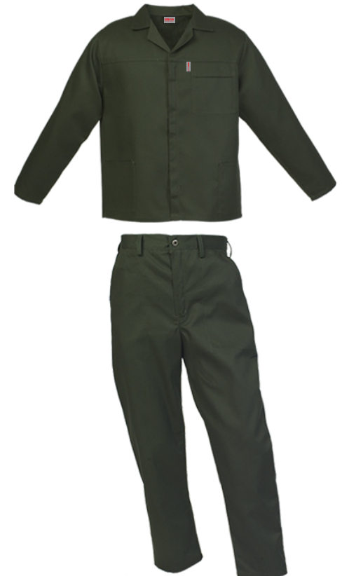
AXBECSAR-COT ACID RESISTANT - GREEN J54 100% cotton

Concealed front zip, bar-tacing on pressure points, jacket features include two side pockets, monza chest pocket with double top-stitching, the pants have 1/2 elasticated waistband with triple-stitching on the inner and outer leg as well as the back and front rise pants feature two side pockets and one back pocket