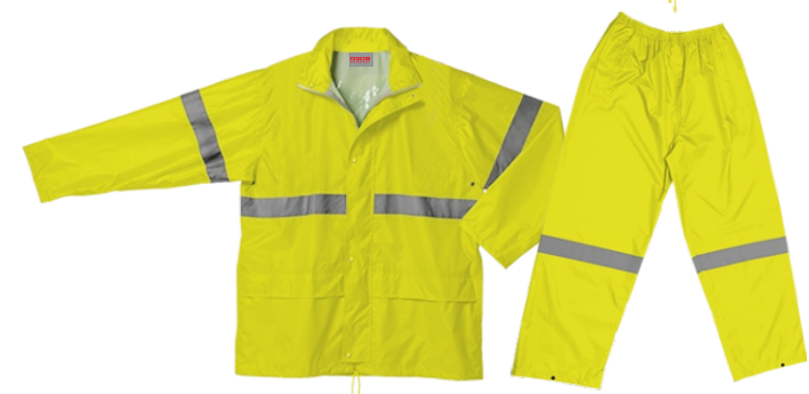
AXKVR-ELE QUALITY RAIN SUIT

Rain jacket with two front patch pockets, elasticated cuffs and storm flap, reflective tape across torso, back and knees, trousers have an elasticated waist and double top-stitching throughout, heat sealed seams