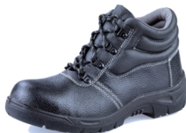
FRAMS CONTRACT BOOT AYFR8402-STC (IMPORTED)