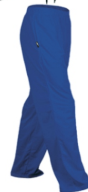
TRACKSUIT AXKVBRT315 200g 100% Polyester