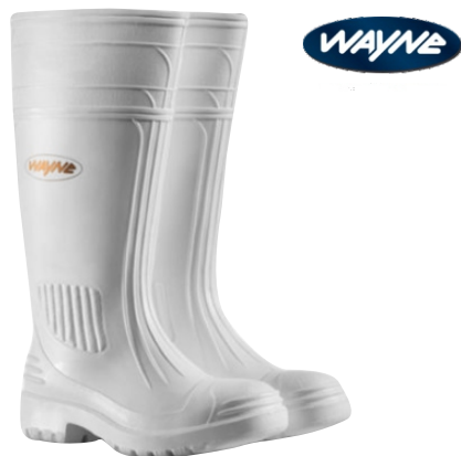
WAYNE MENS GUMBOOTS- WHITE EGOLI 1 KNEE LENGTH- AYWA-F1271 PVC upper • PVC Nitrile Sole • without STC