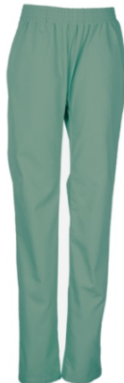
AXKVSC-LCP LADIES SCRUB PANTS 180GM POLYCOTTON