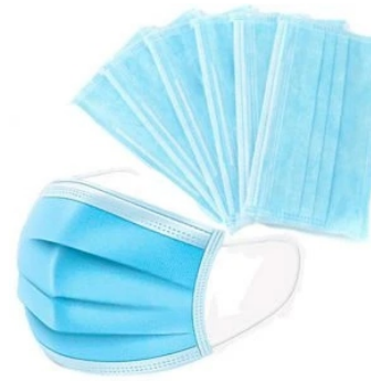
AXBEDISMASK DISPOSABLE MEDICAL FACE MASKS CE CERTIFIED 500+ UNITS