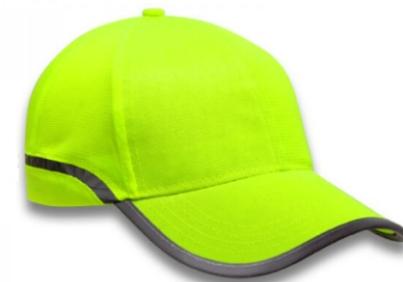
AXCYSHIELD REFLECTIVE 6 PANEL POLYESTER CAP