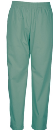
AXKVSC-MCP MENS SCRUB PANTS 180GM POLYCOTTON