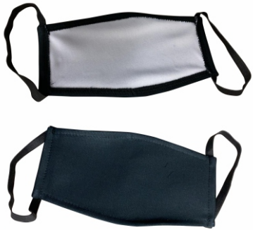
AXBEFMASK 1,2 OR 3 LAYER REUSABLE ECONOMICAL FACE 500+ UNITS