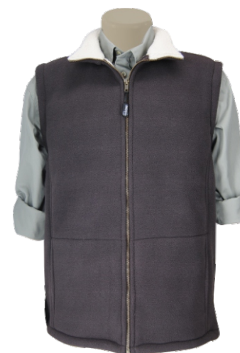
UNISEX SLEEVELESS POLAR FLEECE TOP WITH PKTS AS283CCM - CHOCOLATE / MUSHROOM Fabric: Polar Fleece Normal Size: S - 2XL