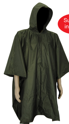
ASTMPONC - ADULTS PONCHO - DURABLE RUBBERISED AND WATERPROOF, IN A BAG CHOCOLATE, 89L X 140W - from R239.21 Fabric: Nylon - Size: OSFA ASTMPONO - OLIVE - from R239.21