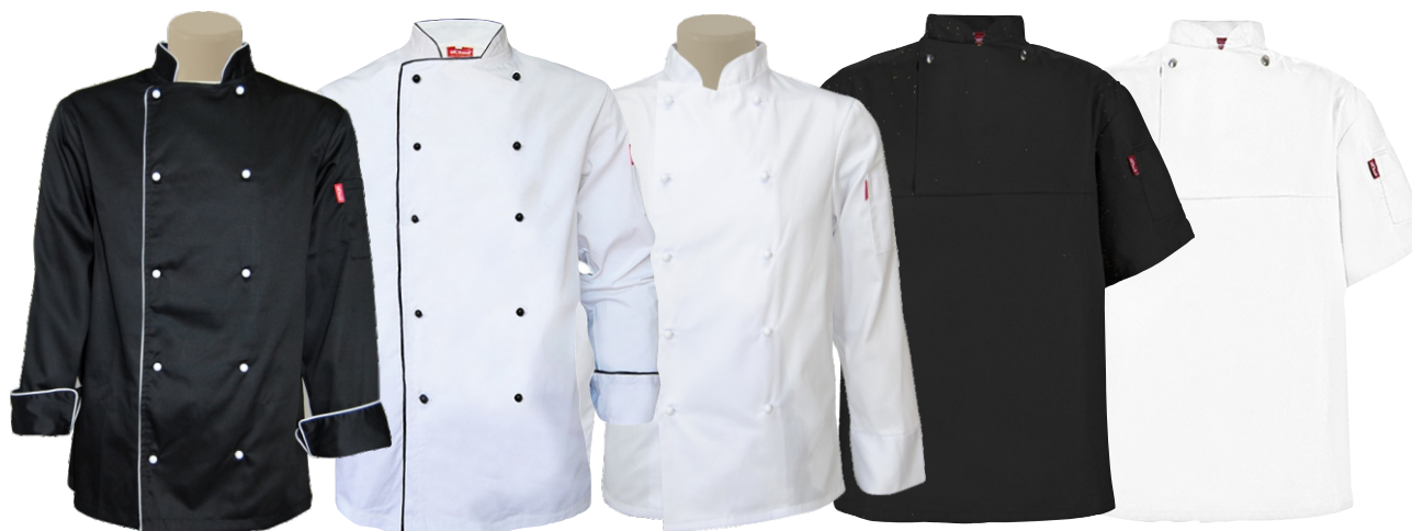
ES2BBW EXECUTIVE from R419.16 Size: 34 - 52