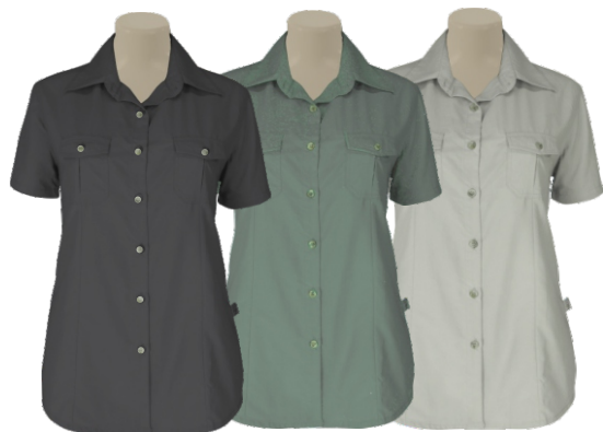
LADIES BUSH SHIRT SHAPED WITH FLAP POCKETS