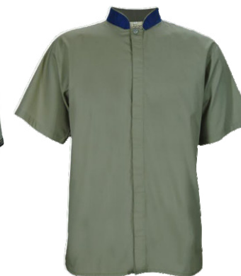
AT1004SS - MENS MANDARIN OPEN COLLAR SHIRT SS WITH COVERED BUTTONSTAND - from R297.00