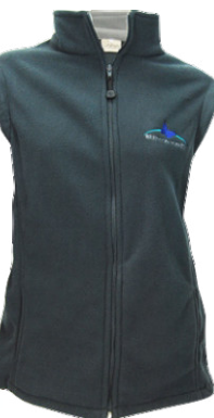
AT1008C - LDS PF SLVLESS TOP WITH PKTS - from R285.00