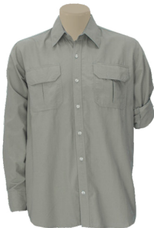
AS370LBV - MENS VENTED BUSH SHIRT LS - from R488.00