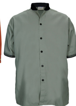
AT159B - MENS MANDARIN COLLAR SS SHIRT WITH OPT PKTS & TRIM - from R290.00