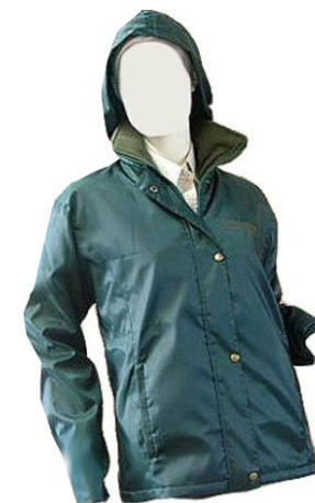
AT813 - LADIES CLASSIC JACKET WITH POLAR FLEECE LINING - from R614.00

Manufactured to your colour and trim detail - wide choice of fabric types and weights. 8 week delivery See Stock Catalogue for immediate delivery • Rise per size • Excl VAT & Freight • T's & C's Apply