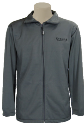
AT1058 - MENS SOFT SHELL JACKET WITH POCKETS - from R395.00