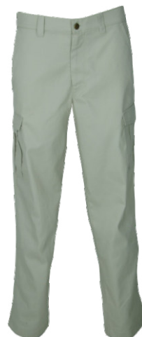
AT857CAR - MENS CARGO FLAT FRONT TROUSERS - R396.00