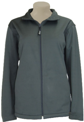
AT1059 - LADIES SOFT SHELL JACKET WITH POCKETS - from R370.00