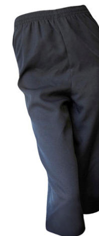
AT987B - LADIES 3/4 COMFORT PULL ON PANTS POLYESTER - from R140.00

Manufactured to your colour and trim detail - wide choice of fabric types and weights. 8 week delivery See Stock Catalogue for immediate delivery • Rise per size • Excl VAT & Freight • T's & C's Apply