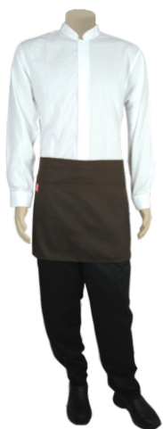
EC33A - BAR APRON WITH POCKET AND OPTIONAL STRIPES - from R121.00