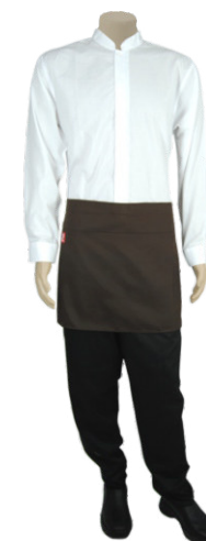
AXTO33 - BAR APRON WITH POCKET from R64.00