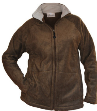
AT1008 - LDS PF TOP, RAGLAN SLV WITH PKTS - from R314.00