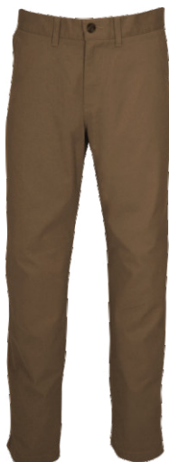
AS857-235 - STOCK 'CLASSIC ORIGINALS' MENS FLAT FRONT CHINOS - STONE, KHAKI & OAK - from R312.00