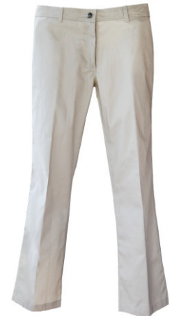
AT747 - LADIES CARGO MIDRISE FLAT FRONT PANTS - from R333.00