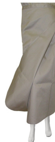
AT070 - LADIES PLAIN WRAP SKIRT, 1 PANEL - from R173.00