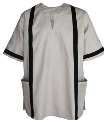
AT781 - UNISEX NECK DETAIL SERVICE STAFF SHIRT SS - from R342.00