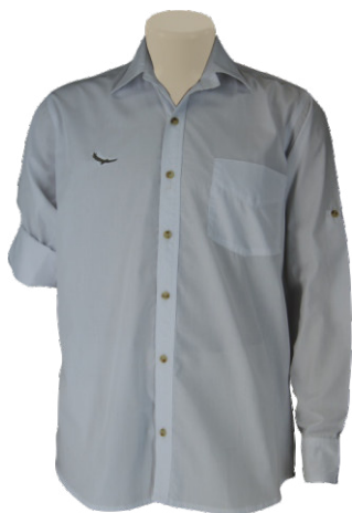
AT370LSV - MENS VENTED HOSTING SHIRT LS - from R397.00