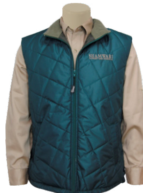
AT397B - MENS SLEEVELESS PUFFER JACKET WITH DIAMOND STITCHING - from R411.00