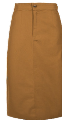
AXTO40 - LADIES HALF ELASTICATED SKIRT WITH BUTTON & ZIP - from R197.00