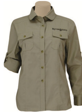
AT787 - LADIES BUSH SHIRT WITH A ROUNDED COLLAR LS - from R397.00