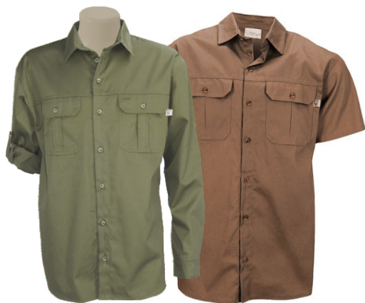
AS044 / AS047-210 - STOCK - RANGERS BUSH SHIRT WITH ROLL UP TABS LS OR SS - from R296.00