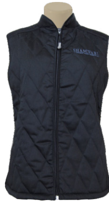
AT737B - LADIES L/LENGTH QUILTED S/LESS JACKET - from R452.00