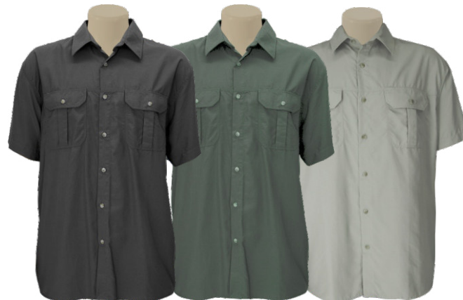
AS044-TECH / AS047-TECH - STOCK - RANGERS BUSH SHIRT WITH ROLL UP TABS LS OR SS OLIVE, STONE OR CHOCOLATE - from R370.00