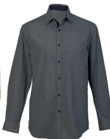
AXKVLO-MAD - MENS POLY COTTON LOUNGE LS SHIRT - from R351.00