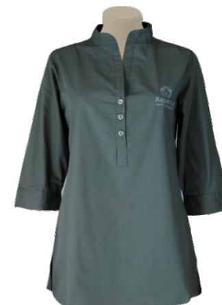
AT1047 - LADIES ¾ SLEEVE SHIRT 1/4 B/S - from R265.00

Manufactured to your colour and trim detail - wide choice of fabric types and weights. 8 week delivery See Stock Catalogue for immediate delivery • Rise per size • Excl VAT & Freight • T's & C's Apply