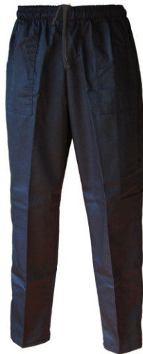
EP11 - BLACK - UNISEX ELASTICATED PANTS WITH PKTS & DRAWCORD - from R193.00