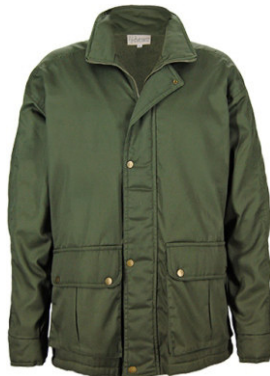
AT396 - PARKA JACKET WITH TWO POCKETS PF LINED CHOICE OF OUTER FABRICS - from R832.00