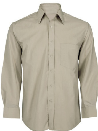
AXKVLO-PLA-LS - MENS CLASSIC LOUNGE SHIRT LS - from R249.00 SS - from R240.00