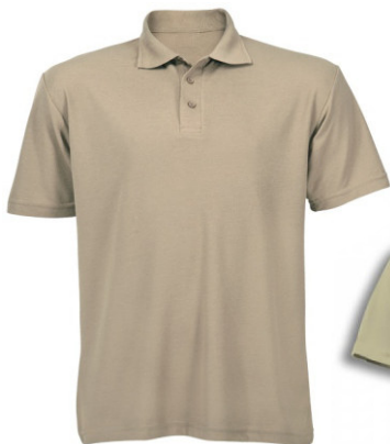
AXKVLAS175B - MENS BASIC POLYCOTTON GOLFER - from R114.00