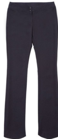
AXCM-TWH-460 - LADIES LOW RISE STRAIGHT LEG PANTS - from R240.00