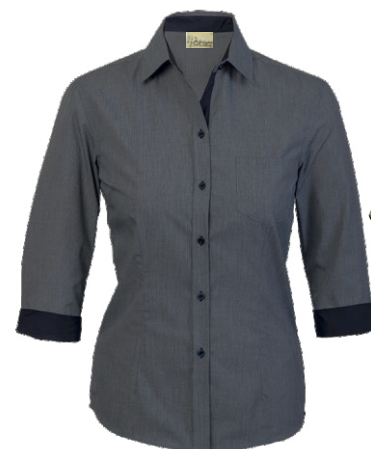
AXKVLL-MAD - LADIES POLY COTTON ¾ SLEEVE FEMININE CUT BLOUSE from R351.00