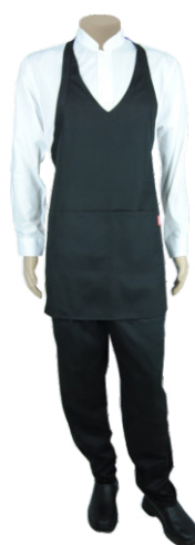
EC41A - V-NECK TUXEDO APRON from R218.00