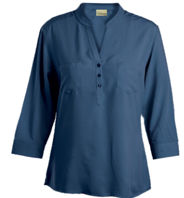
AXKVLL-OAS - LDS ¾ SLEEVE WITH CUFF AND BUTTONS from R443.00