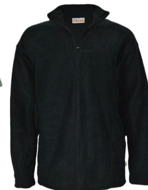
AS283AB - STOCK UNISEX PF TOP, NO POCKETS BLACK - from R256.00

Manufactured to your colour and trim detail - wide choice of fabric types and weights. 8 week delivery