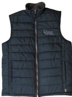
AT397 - MENS SLEEVELESS RIGID PUFFER JACKET - from R436.00