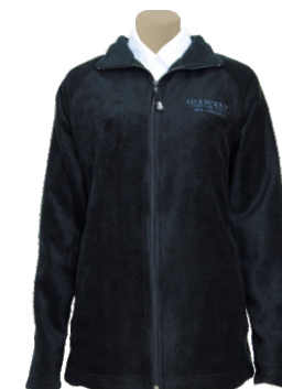
AT1008A - LADIES POLAR FLEECE TOP, RAGLAN SLEEVE, NO PKTS TOP - from R285.00

Manufactured to your colour and trim detail - wide choice of fabric types and weights. 8 week delivery See Stock Catalogue for immediate delivery • Rise per size • Excl VAT & Freight • T's & C's Apply