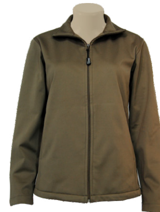
AT1059-SS - LADIES SOFT SHELL JACKET WITH POCKETS - from R445.00