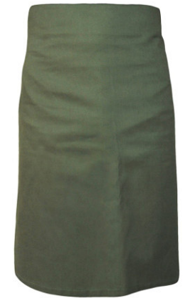
AT772A - LADIES ALINE 70CM KNEE SKIRT - from R164.00