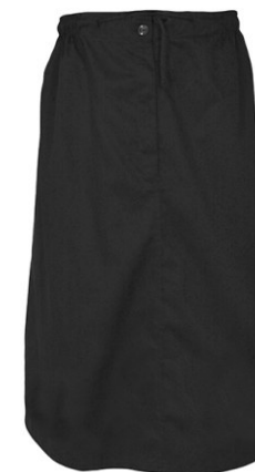
AT064B - LADIES COMFORTABLE SKIRT - - from R202.00