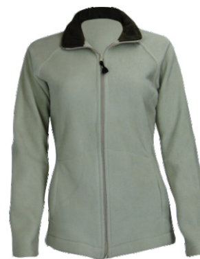
AT1003 - LADIES FITTED RAGLAN SLEEVE POLAR FLEECE TOP WITH PKTS - from R308.00