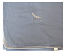
LUXURY BUSH BLANKET AT456A - 145 X 145CM - from R314.00 AT456B - 145 X 200CM - from R400.00 PC TWILL & POLAR FLEECE