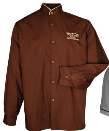
AT371B - MENS MANDARIN COLLAR SHIRT LS - from R339.00