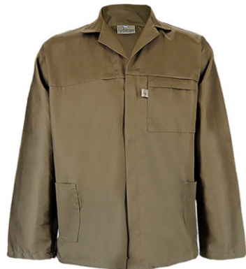
AXKVCS-BPC 2 PIECE CONTI SUIT - from R212.00