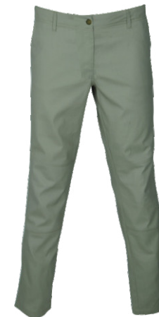
AT1026 - LADIES LOW RISE FLAT FRONT TROUSERS - from R266.00