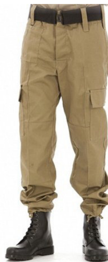
AXTOCOMMOCK MENS MOCK COMBAT SECURITY TROUSERS - from R209.00