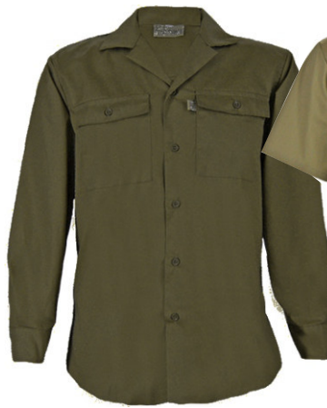
AXTOBLS - TRACKER BUSH SHIRT GLADNECK LS - from R227.00