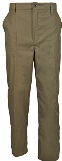
AXTOPAN PANTS WITH FLY AND HALF ELASTICATED - from R209.00