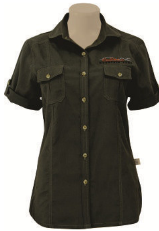
AT735 - LADIES BUSH SHIRT WITH A ROUNDED COLLAR SS - R327.00