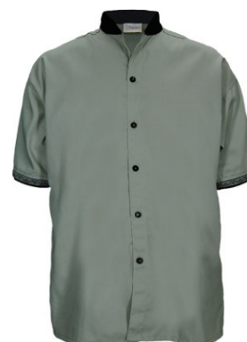
AT159B - MENS MANDARIN COLLAR BUTTON SHIRT SS OPT PKTS AND TRIM - from R290.00