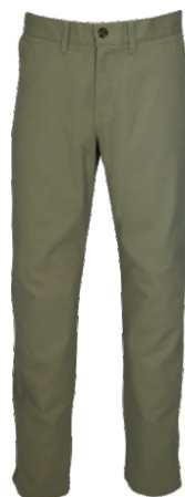
AS857-235 - STOCK 'CLASSIC ORIGINALS' MENS FLAT FRONT CHINOS, OLIVE, STONE & OAK - from R312.00