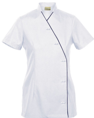
AXKVTU-IVY - LADIES TUNIC MANDARIN COLLAR, SS - from R258.00