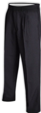
AXCM-TG1-460 - MENS SERVICE STAFF POLY TROUSERS - from R295.00