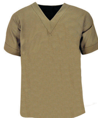
AT155 - UNISEX V-NECK TUNIC SS - from R236.00