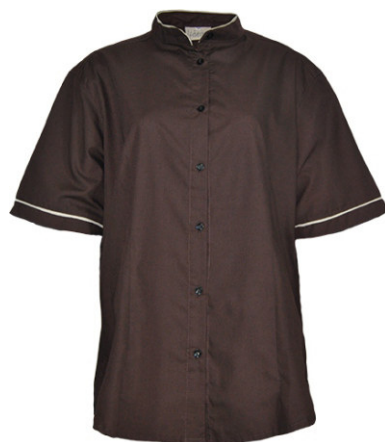
AT729B - LADIES BUTTONUP MANDARIN COLLAR SHIRT SS - from R360.00