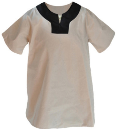
AT780 - UNISEX TUNIC SS - from R225.00