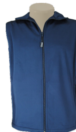
AT1058B - MENS SOFTSHELL JACKET SLEEVELESS WITH PKTS - from R405.00