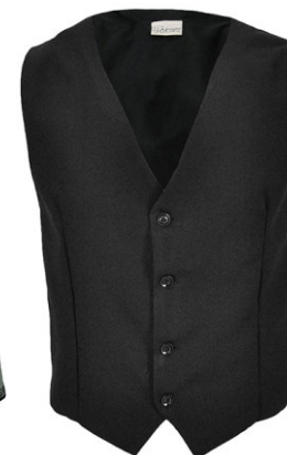
AT870 - UNISEX WAISTCOAT FULLY LINED - from R329.00