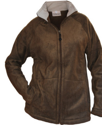
AS1008 - STOCK - LADIES PF TOP, RAGLAN SLEEVE, PKTS, CHOC/MUSH & STONE - from R308.00