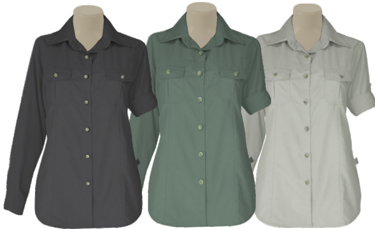
AS150 - STOCK - LADIES TECH BUSH SHIRT LS AND SS SHAPED WITH FLAP PKTS, STONE, OLIVE & CHOCOLATE - from R301.00