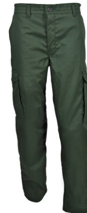
AXTOPANTCARG TRACKER CARGO PANTS WITH FLY AND HALF ELASTICATED - from R229.00