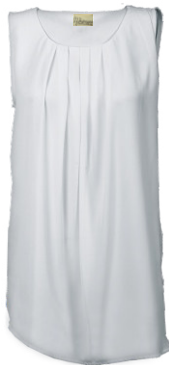
AXKVLL-LOT - LDS LONGER LENGTH FRONT OVERLAY PANEL from R258.00