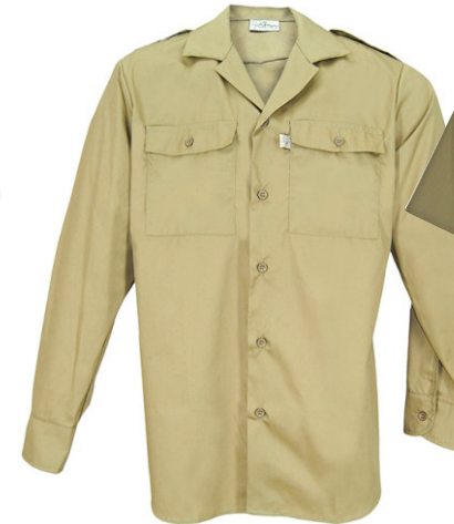
AXTOBLSE - TRACKER BUSH SHIRT GLADNECK LS WITH EPAULETTES - from R240.00