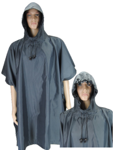
AT566F - PONCHO CLOSED NECK UNLINED KNEE LENGTH - from R325.00 WP OXFORD NYLON