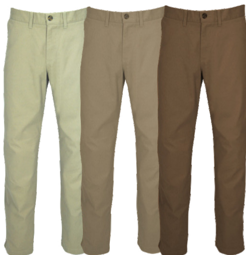
AS857CHI-235 - STOCK MENS FLAT FRONT 'CLASSIC ORIGINAL' CHINOS - STONE, KHAKI, OAK- from R312.00