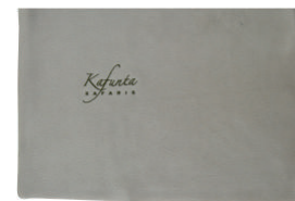
PF BLANKET RAW CUT EDGE AT454F - 140 X 100 - from R85.00 AT454E - 140 X 150 - from R126.00 AT454G - 140 X 200 - from R160.00