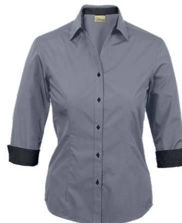
AXKVLL-SAG - ¾ SLEEVE BLOUSE CONTRAST INNER CUFFS AND COLLAR STAND - from R443.00