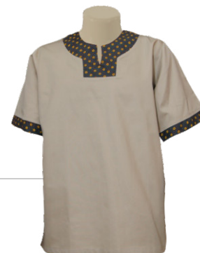
AT780C - UNISEX TUNIC SS WITH SHWESHWE NECK & SLEEVE TRIM - from R283.00