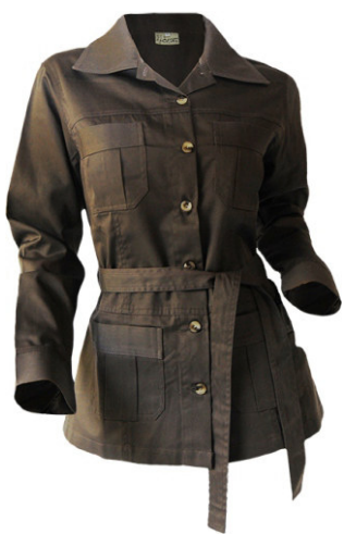
AT010 - LADIES BUSH STYLE JACKET - from R569.00