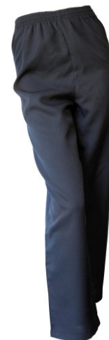
AT987 - LADIES ELASTICATED PANTS - from R148.00