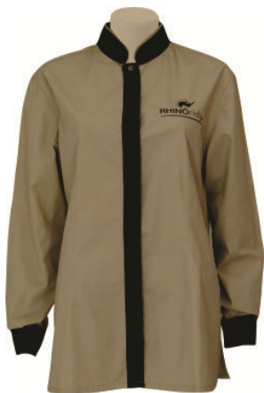
AT1063LS - LADIES OPEN MANDARIN COLLAR SHIRT LS COVERED B/S - from R334.00