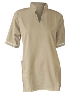
AT966 - LADIES SS V NECKLINE SERVICE TUNIC - from R218.00