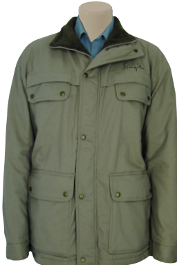
AT395 - PARKA JACKET WITH PF LINING & FOUR POCKETS CHOICE OF OUTER FABRICS - from R1113.00