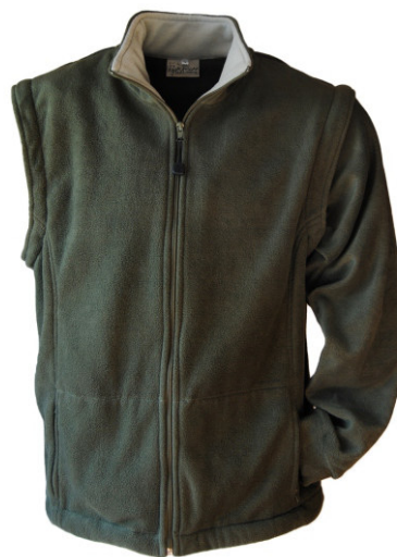
AT283D - MENS ZIP-OFF SLV PF TOP WITH PKTS - from R437.00