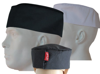
EP6 CHEFS BEANIE WITH TONAL TOP PIPING AND HIDDEN VELCRO CLOSER 7,5H X 18Dcm • BLACK from R52.70 • WHITE from R47.60