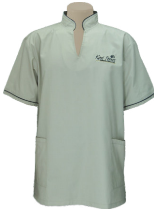
AT966B - MENS SS V NECKLINE TUNIC - from R225.00