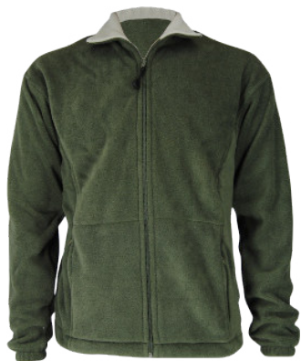
AT283 | AS283 UNISEX POLAR FLEECE WITH POCKETS - from R322.00