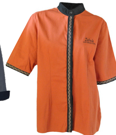
AT159D - LADIES MANDARIN COLLAR BUTTONUP SHIRT SS OPT PKTS AND TRIM - from R307.00