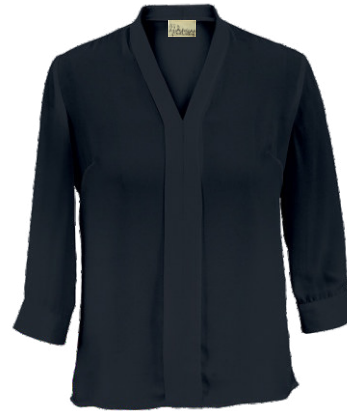
AXKVLL-TUL - LDS ¾ SLEEVES, SHAPED HEM from R314.00