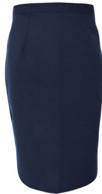
AXCM-KW1-460 LADIES CORE SKIRT, 64CM UNLINED POLYESTER - from R190.00