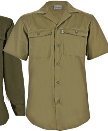
AXTOBSS - TRACKER BUSH SHIRT GLADNECK SS - from R199.00