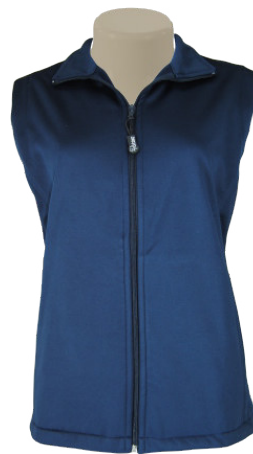
AT1059B - LADIES SOFT SHELL JACKET SLEEVELESS WITH PKTS - from R382.00