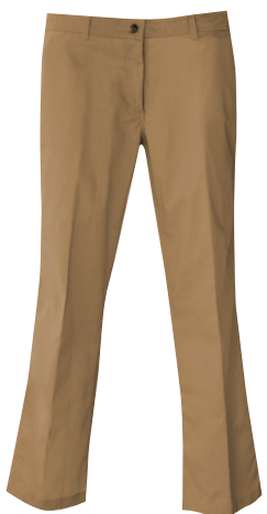
AT747B - LADIES CARGO MIDRISE FLAT FRONT TROUSERS - from R308.00