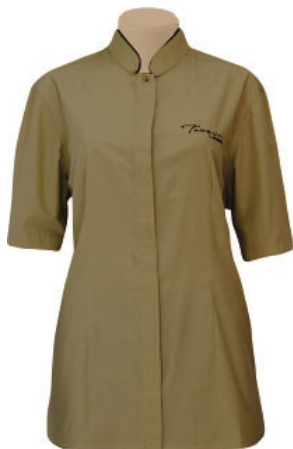
AT1063SS - LADIES OPEN MANDARIN COLLAR SHIRT SS COVERED B/S - from R294.00