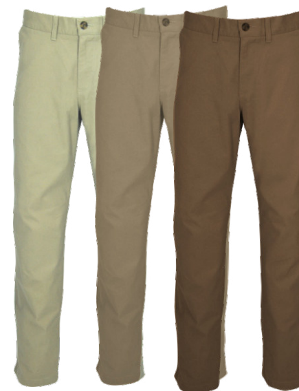
AS857-235 - STOCK 'CLASSIC ORIGINALS' MENS FLAT FRONT CHINOS • Premier brand at wholesale pricing • Washed & brushed 100% cotton twill • Back jet pocket • YKK Zipper • SABS quality fabric Size: Men 30 - 44 - from R312.00

Manufactured to your colour and trim detail - wide choice of fabric types and weights. 8 week delivery See Stock Catalogue for immediate delivery • Rise per size • Excl VAT & Freight • T's & C's Apply