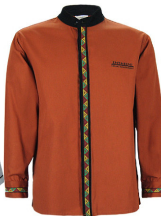
AT131 - MENS MANDARIN COLLAR SHIRT LS OPT PKT AND TRIM - from R354.00