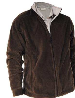
AS283 | AT283 - UNISEX POLAR FLEECE WITH POCKETS As283 - from R310.00 At283 - from R322.00