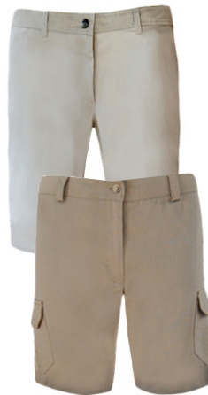
AT747E / AT747F - LADIES CARGO MIDRISE FLAT FRONT SHORTS from R310.00