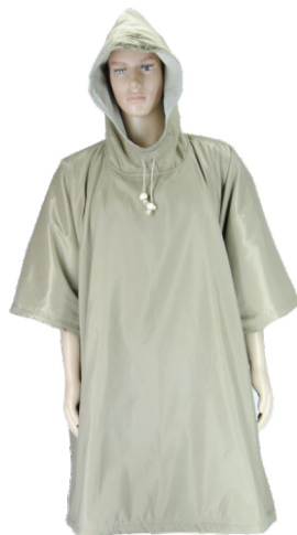
AT566E - PONCHO CLOSED NECK PF LINED KNEE LENGTH - from R587.00 WP OXFORD NYLON & POLAR FLEECE