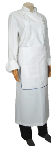
AT1076 - HALF APRON WITH PIPED POCKET from R163.00

Manufactured to your colour and trim detail - wide choice of fabric types and weights. 8 week delivery