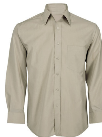
AXKVLO-PLA-LS - POLYCOTTON CLASSIC LOUNGE SHIRT LS - from R249.00 - SS - from R240.00