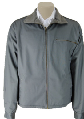
AT750 - MANAGERS JACKET - from R625.00