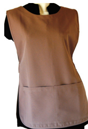
AT833B - SPA TABARD - LONGER LENGTH, SIDE BUTTON CLOSURES FULL FRONT DOUBLE PKT - from R266.00