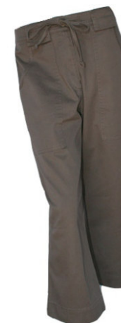
AT014 - LADIES DRAWSTRING CAPRI PANTS - from R244.00