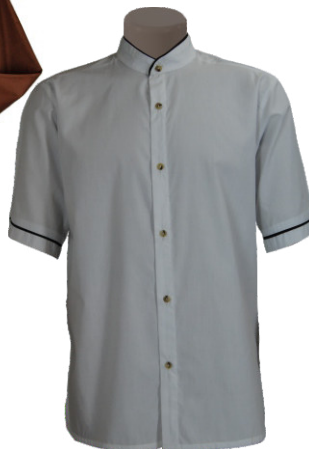
AT371 - MENS MANDARIN COLLAR SS SHIRT - from R307.00