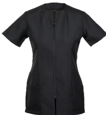
AXKVTU-CAM - LDS SHAPED WAIST TUNIC, SIDE SLITS OPEN END & NYLON ZIP - from R314.00

- LADIES FORMAL MIDRISE BOOTLEG PANTS POLYESTER - from R240.00