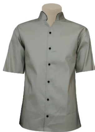
AT1072SS - MENS OPEN MANDARIN COLLAR SHIRT SS - from R342.00