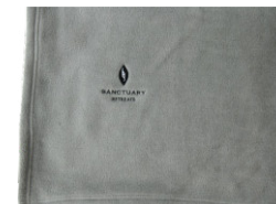
PF BLANKET HEMMED EDGE AT454D - 140 X 150 - from R185.00 AT454C - 140 X 180 - from R208.00 AT454H - 140 X 200 - from R223.00