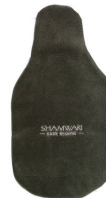
AT453 - HOT WATERBOTTLE cover - from R69.00

Manufactured to your colour and trim detail - wide choice of fabric types and weights. 8 week delivery