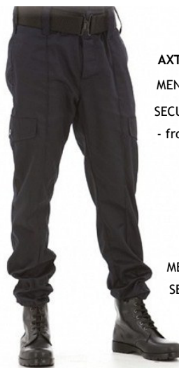
AXTOCOMFULL MENS FULL COMBAT SECURITY TROUSER - from R240.00