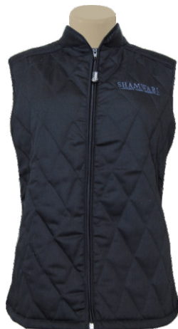
AT737B - LADIES L/LENGTH QUILTED S/LESS JACKET - from R421.00