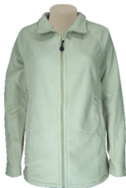
AS1008 - STOCK - LDS PF TOP, RAGLAN SLV WITH PKTS, CHOC/MUSH & STONE - from R308.00