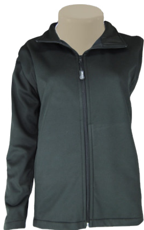
AT1059C - LADIES SOFT SHELL JACKET WITH ZIP-OFF SLEEVES AND PKTS - from R507.00