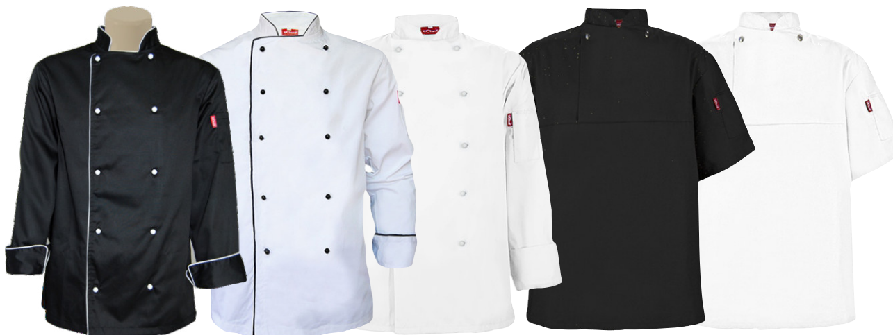
ES2BBW EXECUTIVE from R418.45