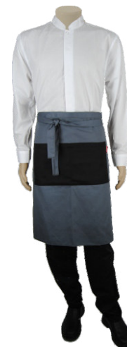
AT1048 - BISTRO CONTRAST HALF APRON from R110.00