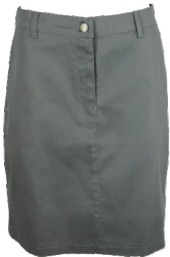
AT066H - LADIES MANAGEMENT SKIRT FRONT ZIP, KNEE LENGTH 54CM - from R292.00