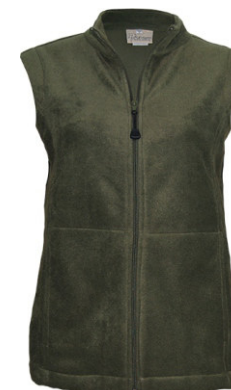
AT026C - LADIES FITTED SLEEVELESS POLAR FLEECE TOP - from R293.00