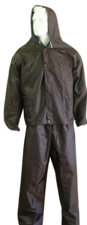
AXTMRAINSUIT - RAINSUIT IN A BAG - 2 PIECE - from R224.00