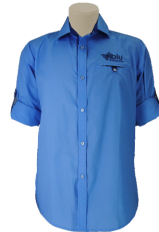
AT1037 - SLIM FIT LOUNGE SHIRT LS - from R354.00