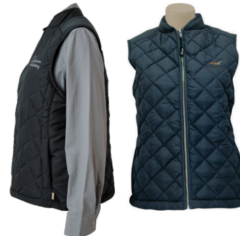
AT737C - LADIES QUILTED S/LESS JACKET WITH SIDE PANELS - from R454.00