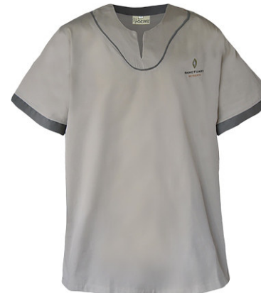
AT780E - UNISEX TUNIC SS WITH PIPING & SLEEVE TRIM - from R250.00