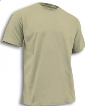
AXCYCLASSICT - COMBED COTTON 165G TSHIRT - from R73.00