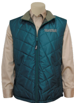
AT397B - MENS SLEEVELESS PUFFER JACKET WITH DIAMOND STITCHING - from R411.00