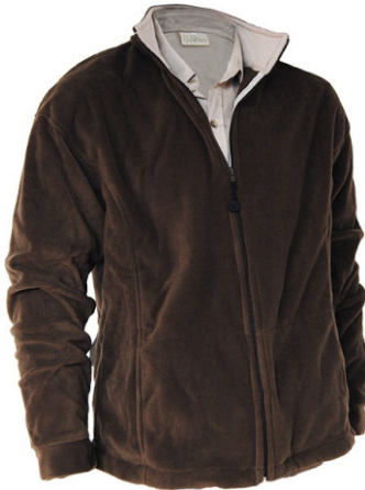
AS283 - STOCK - MENS PF TOP WITH POCKETS - from R310.00