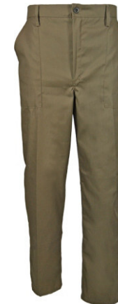
AXTOPAN - TRACKER PANTS WITH FLY AND HALF ELASTICATED from R209.00