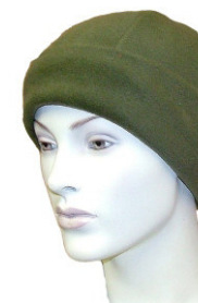
AT001 - POLAR FLEECE BEANIE from R81.00