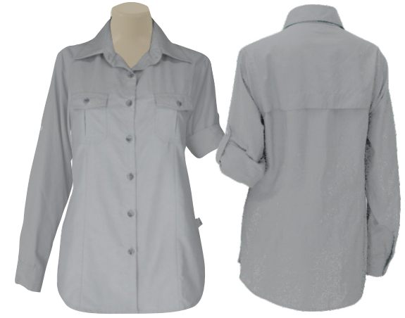
AS150V - LADIES SHIRT CLASSIC SHAPED WITH BACK VENT - GREY - R389.00