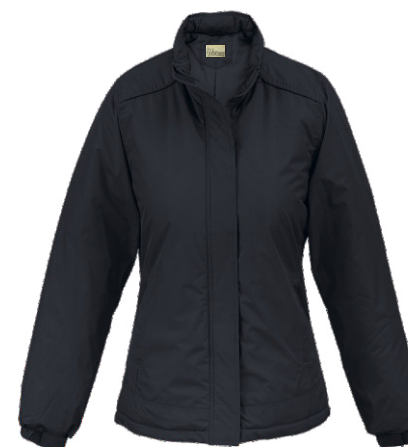
AXKVLTR-JAC - LDS NYLON WIND & WATER RESISTANT LS JACKET from R488.00