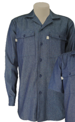
AXTOBLS-DEN DEMIN SHIRT LS - from R259.00