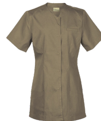
AXKVTU-KEL - LADIES SS TUNIC from R258.00