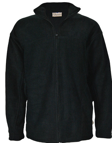
AS283AB-NOR - STOCK - UNISEX SERVICE STAFF PF TOP WITH NO POCKETS - from R256.00