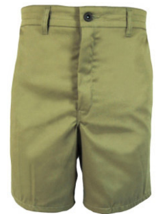
AXTOSHO - TRACKER SHORTS WITH FLY AND HALF ELASTICATED - from R142.00

Manufactured to your colour and trim detail - wide choice of fabric types and weights. 8 week delivery See Stock Catalogue for immediate delivery • Rise per size • Excl VAT & Freight • T's & C's Apply