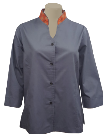
AT1073 - LADIES LS SHIRT SHAPED MANDARIN NECKLINE - from R262.00