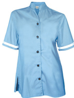
AT159 - LADIES OPEN NECK SHIRT SS OPT PKTS AND TRIM - from R284.00