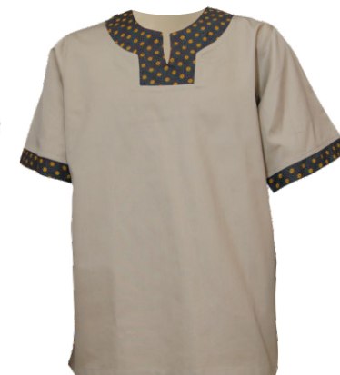
AT780C - UNISEX TUNIC SS WITH SHWESHWE NECK & SLEEVE TRIM - from R283.00