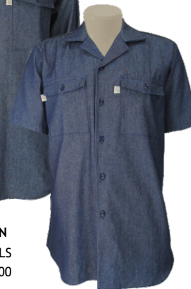
AXTOBSS-DEN DENIM SHIRT SS - from R231.00