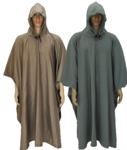
AT566 - PONCHO PF LINED, KNEE LENGTH - from R494.00 AT566C - PONCHO PF LINED ANKLE LENGTH - from R657.00 AT566B - PONCHO PF LINED CALF LENGTH - from R582.00 AT566D - PONCHO UNLINED KNEE LENGTH - from R285.00 AT566G-NOR - PONCHO PF CALF 1,2M UNLINED - from R425.00