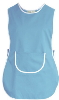
AXTOTAB - STANDARD TABARD CONTRAST BINDING - from R144.00