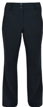
AXCM-TW6-460 LADIES FORMAL MIDRISE BOOTLEG PANTS - from R240.00