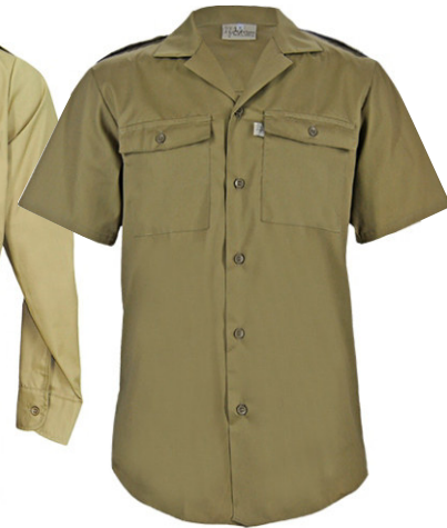
AXTOBSSE - TRACKER BUSH SHIRT GLADNECK SS WITH EPAULETTES - from R212.00