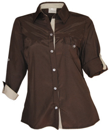
AT820 - LADIES 3/4 SLEEVE SHIRT WITH ROLLUP SLEEVE - from R387.00