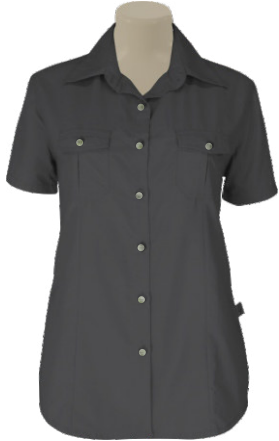
AS150F-TECH - STOCK - LADIES BUSH SHIRT SHAPED WITH FLAP PKTS SS, STONE, OLIVE & CHOCOLATE - from R317.00