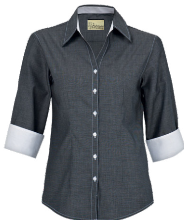
AXKVLL-ONLY - ¾ SLEEVES WITH CONTRAST TURN-UP CUFFS - from R332.00