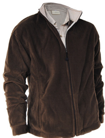
AS283 - STOCK - UNISEX POLAR FLEECE TOP WITH POCKETS, CHOC/MUSH & OLIVE/STONE - from R310.00