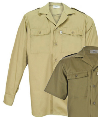
AXTOBLSE - TRACKER BUSH SHIRT GLADNECK LS WITH EPAULETTES - from R240.00