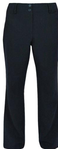
AXCM-TW6-460 LADIES FORMAL MIDRISE BOOTLEG PANTS - from R240.00