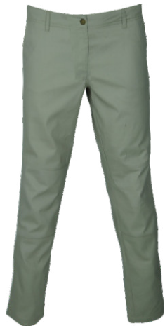
AT1026 - LADIES LOW RISE FLAT FRONT TROUSERS from R266.00