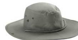
AXCYBUSHHAT - BUSH HAT WITH SIDE STUDS, SOFT WIDE BRIM AND NECK CORD - from R92.00