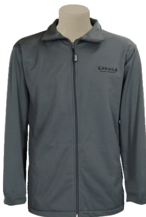
AT1058 - MENS SOFTSHELL JACKET WITH PKTS - from R483.00