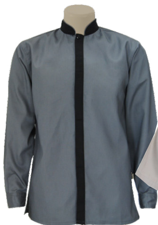
AT1004LS - MENS MANDARIN OPEN NECK COLLAR, COVERED BUTTONSTAND SHIRT LS - from R354.00 - SS - from R297.00