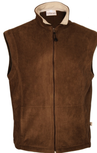
UNISEX SLEEVELESS POLAR FLEECE TOP WITH PKTS AS283CCM - CHOCOLATE / MUSHROOM - from - R292.00 Fabric: Polar Fleece Normal Size: S - 2XL