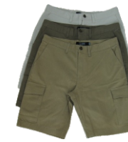
AS856BC - INNER LEG 26cm from R369.00