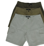
AS856CC - INNER LEG 21cm from R369.00