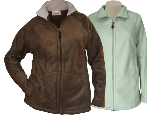
LADIES PF TOP, RAGLAN SLV, PKTS, INNER COLLAR AS1008CM - CHOCOLATE / MUSHROOM AS1008ST - STONE - from R302.00 Fabric: Normal Polar Fleece Size: S - 2XL