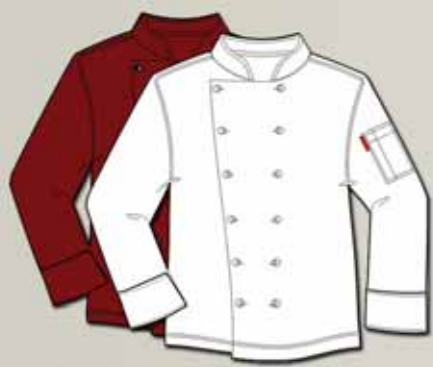
EC1-210 - Poppers Unisex basic Chefs jacket L/S