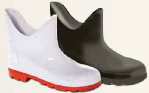
AYBT781995 PVC Kitchen / Chef Mid Boot