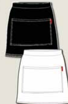
EC33A-210 Bar apron with pocket white or black