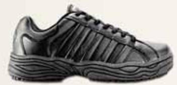
AYCT55037 Bistro leather trainer