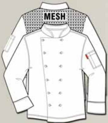
EC34-210 - Poppers Unisex basic Chefs jacket L/S with breathable mesh insert white only