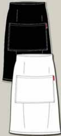
EC8A-210 Half apron with pocket white or black