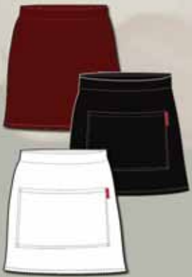
EC33 Bar apron pocket optional various colours no pkt / pkt