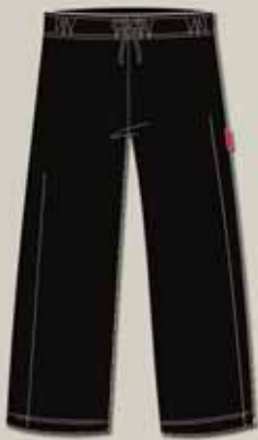
EP11-PC-B Chefs pants with elasticated waistband, pockets & drawcord black