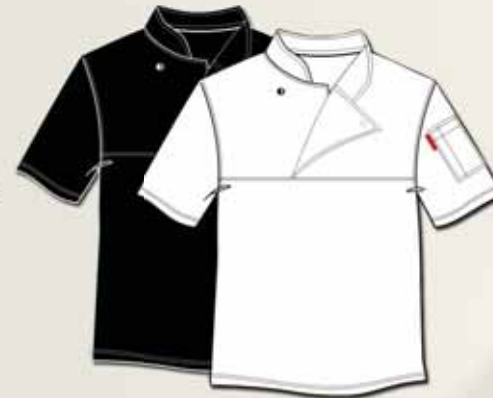
EP17-200-W Chefs Shirt with front flap & press stud white or black