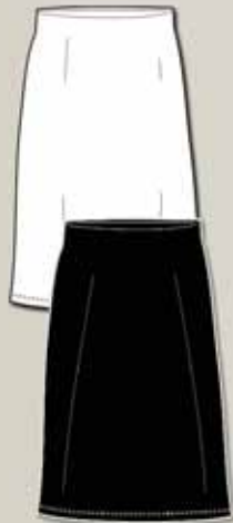
EC8-210 Half apron no pocket white or black