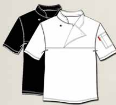
EC17-210 - Stud 1 Chefs Shirt with front flap