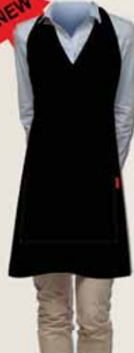
EC41A-210 V-neck tuxedo apron front pkt