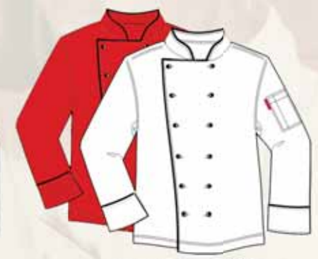
EC2B-210 - Stud 3 Unisex executive Chefs jacket with piping