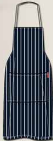
EC10 Bib butchers apron pocket optional stripes or checks no pkt / pkt