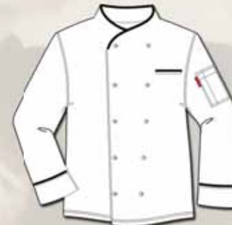
EC30-210 - Poppers Unisex executive Chefs neckline jacket with piping