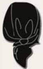
EP21 Bandanna with panels various colours