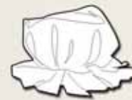
EC13-210 Mop cap various colours