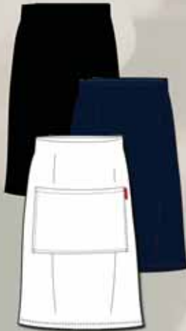
EC8 Half apron pocket optional various colours no pkt / pkt