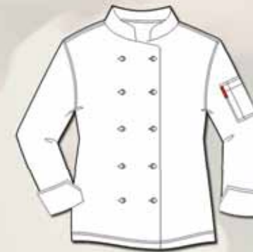
EC24-210 - Poppers Ladies basic double breasted jacket L/S