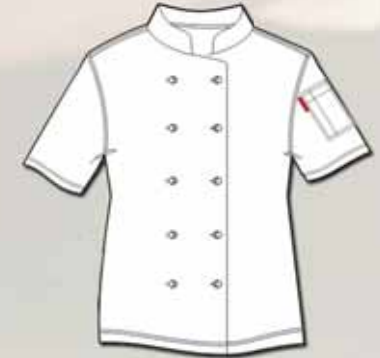
EC40-210 - Poppers Ladies basic double breasted jacket S/S