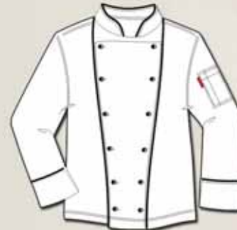
EC3-210 - Poppers Unisex executive Chefs jacket with piping