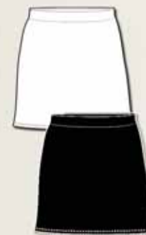
EC33-210 Bar apron no pocket white or black