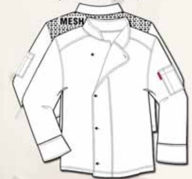
EC28-210 - Stud 2 Breathable Chefs jacket with back mesh insert white only