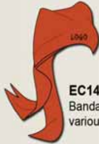
EC14-210 Bandanna various colours