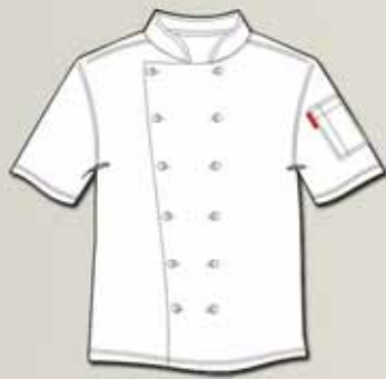
EC18-210 - Poppers Unisex basic Chefs jacket S/S