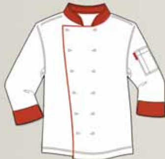
EC38-210 - Poppers Unisex 3/4 slv with piping, contrast collar and cuffs