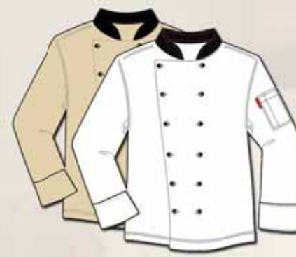
EC2-210 - Poppers Unisex executive Chefs jacket with contrast panels