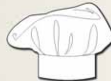
EC5-210 Chefs hat various colours