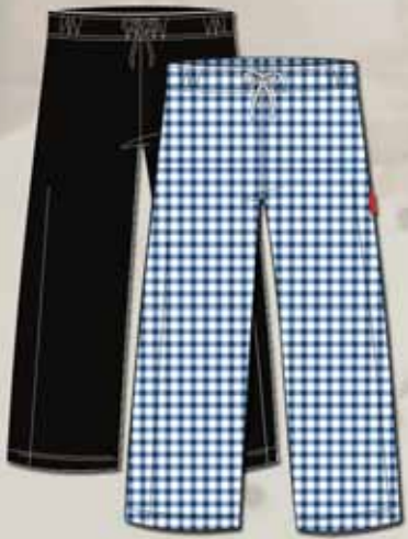
EC11-210 Chefs pants with elasticated waistband, pockets & drawcord Checks and stripes