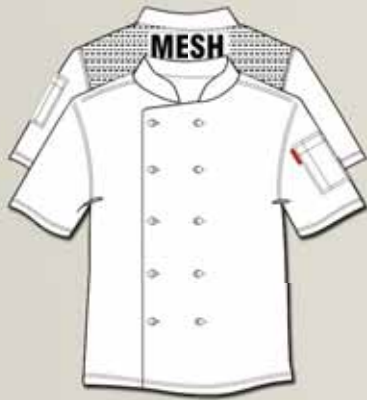
EC35-210 - Poppers Unisex basic Chefs jacket S/S with breathable mesh insert white only