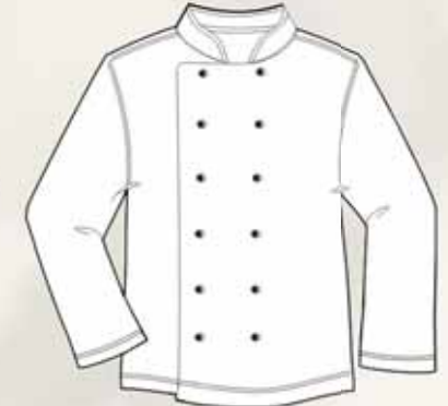
AXBE-STUD Unisex basic Chefs jacket L/S white with stud 2 closers white