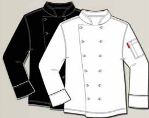
EP1-200-W / B Unisex basic Chefs jacket L/S with poppers white or black