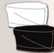
EC6-210 Chefs beanie white or black