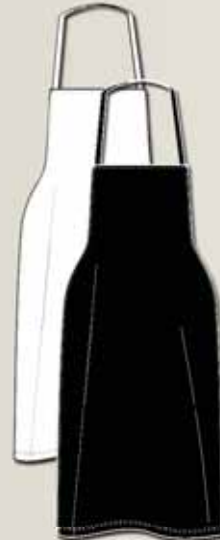
EC9-210 Bib full front apron no pocket white or black