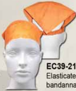
EC39-210 Elasticated bandanna