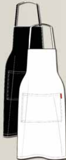
EC9A-210 Bib full front apron with pocket white or black