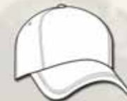
EP19 Cap 5 panel various colours