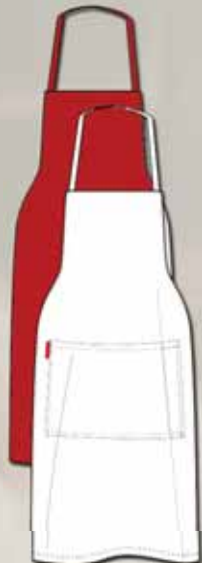
EC9 Bib full front apron pocket optional various colours no pkt / pkt