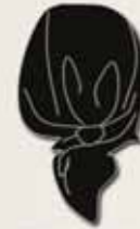
EC21-210 Bandanna with panels various colours