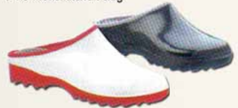
AYBT681986 PVC Ladies kitchen clog