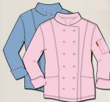
EC32-210 - Buttons Ladies French Cut jacket with 3 pockets and buttons