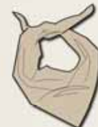
EC7-210 Chefs neck tie various colours