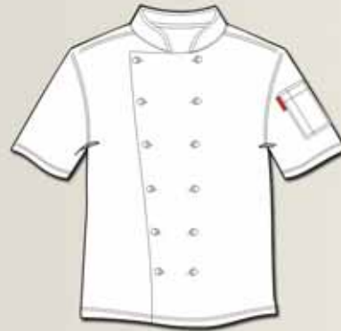
EP18-200-W Unisex basic Chefs jacket S/S white with poppers white