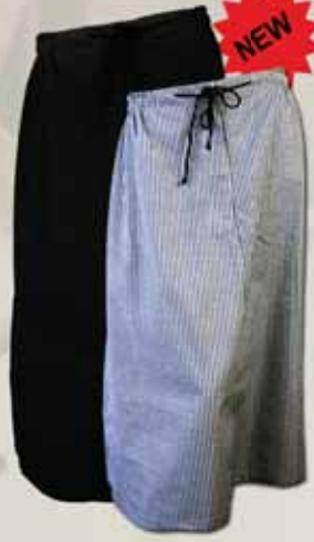
AT064B-210 Ladies comfortable skirt half elasticated waist, zip and button, no pockets checks or stripes