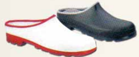
AYBT781986 PVC Mens kitchen clog