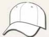
EP20 Cap 6 panel various colours