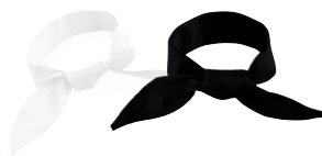
EP7 - BANDANNA OR DOEK, TRIANGULAR 100 X 70 X 70cm • BLACK from R52.00 • WHITE from R52.00