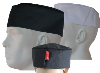
EP6 CHEFS BEANIE WITH TONAL TOP PIPING AND HIDDEN VELCRO CLOSER 7,5H X 18Dcm • BLACK from R62.00 • WHITE from R56.00