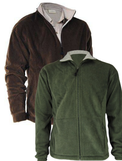
UNISEX POLAR FLEECE TOP WITH POCKETS AS283CM - CHOCOLATE / MUSHROOM AS283OS - OLIVE / STONE - from R334.66 Fabric: Normal Polar Fleece Size: XS - 3XL