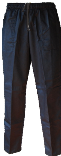
AXBE11 UNISEX ELASTICATED PANTS WITH 3 POCKETS & DRAWCORD • BLACK from R159.00 Size: S - 3XL