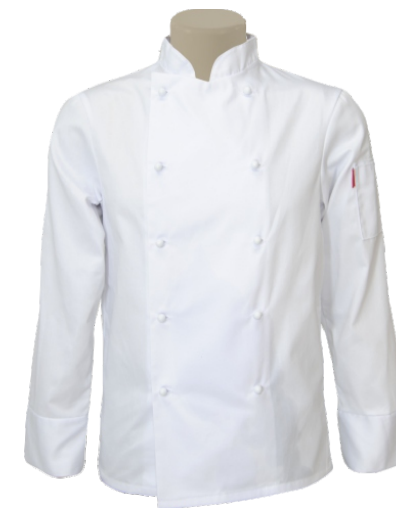
AXBE1 - WHITE DOUBLE BREASTED L/S 80/20 POLYCOTTON TWILL from R149.00 Size: S - 3XL