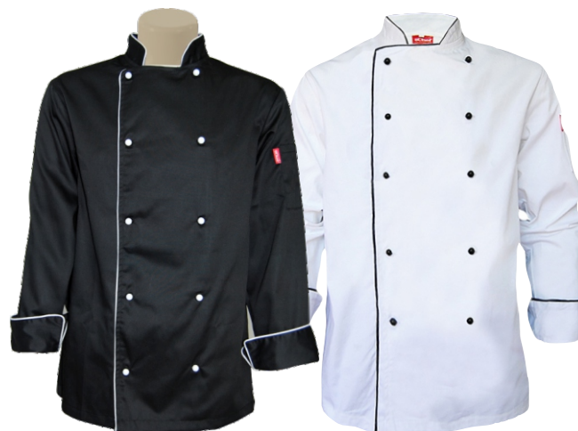
ES2BBW EXECUTIVE CHEFS - WHITE 65/35 POLYCOTTON TWILL from R462.70 Size: 34 - 52