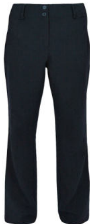
AXCM-TW6-460 LADIES FORMAL MIDRISE BOOTLEG PANTS - from R231.00