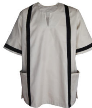
AT781 - UNISEX NECK DETAIL SERVICE STAFF SHIRT SS - from R316.00