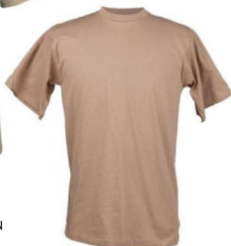
AXTLC180 - COTTON 180G TSHIRT - from R70.00