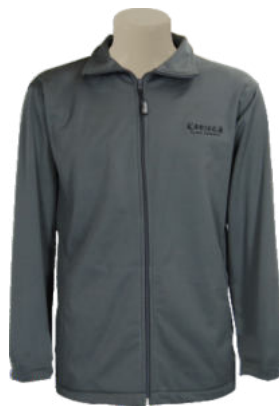
AT1058 - MENS SOFT SHELL JACKET WITH POCKETS - from R472.00