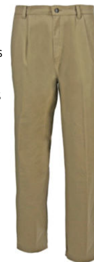
AT751CHI - MENS FRONT PLEATED CHINOS - from R338.00

Manufactured to your colour and trim detail - wide choice of fabric types and weights. 5 - 6 week delivery • Shading may occur within stock garment orders due to varying fabric batches • See Stock Catalogue for immediate delivery • Rise per size • Excl VAT & Freight • T's & C's Apply