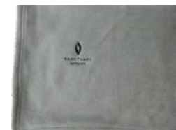
PF BLANKET HEMMED EDGE AT454D - 140 X 150 - from R171.00 AT454C - 140 X 180 - from R193.00 AT454H - 140 X 200 - from R207.00