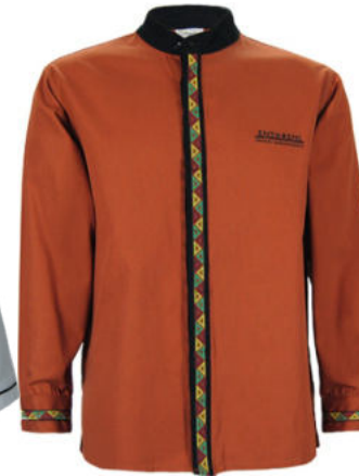
AT131 - MENS MANDARIN COLLAR SHIRT LS OPT PKT AND TRIM - from R328.00