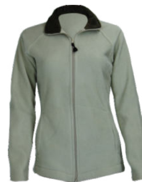
AT1003 - LADIES FITTED RAGLAN SLEEVE POLAR FLEECE TOP WITH PKTS - from R285.00