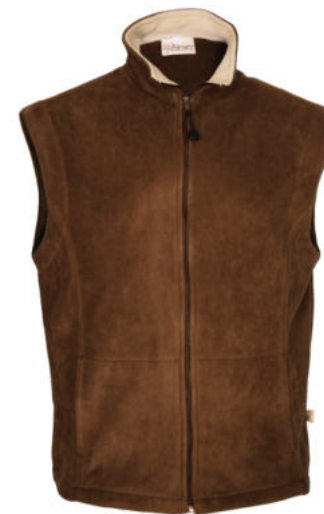
AT283C - UNISEX S/LESS PF TOP WITH PKTS - from R270.00