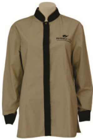
AT1063LS - LADIES OPEN MANDARIN COLLAR SHIRT LS COVERED B/S - from R308.00