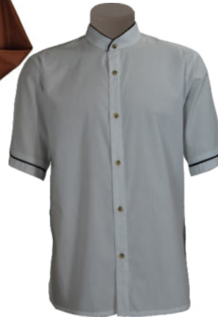
AT371 - MENS MANDARIN COLLAR SS SHIRT - from R285.00