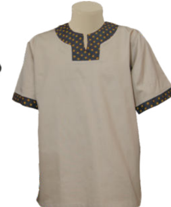
AT780C - UNISEX TUNIC SS WITH SHWESHE NECK & SLEEVE TRIM - from R263.00