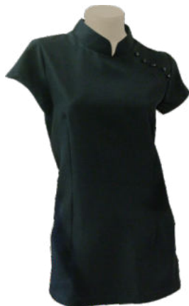
AT788 - LADIES SPA TOP SS BACK PLEAT & BUTTON DETAIL - from R271.00