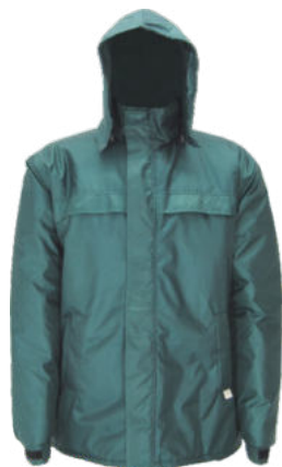
AS1069G - STOCK JACKET WATER RESISTANT WARM QUILTED PADDED LINING & FOLD-IN HOOD, BOTTLE GREEN - from R514.00