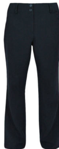
AXCM-TW6-460 LADIES FORMAL MIDRISE BOOTLEG PANTS - from R231.00