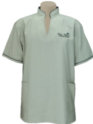
AT966B - MENS SS V NECKLINE TUNIC - from R210.00