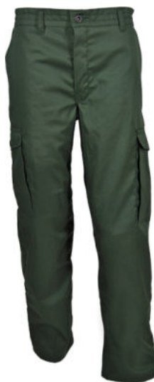
AXTOPANTCARG - TRACKER CARGO PANTS WITH FLY AND HALF ELASTICATED - from R229.00