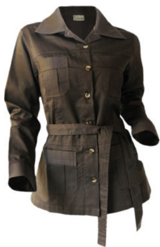
AT010 - LADIES BUSH STYLE JACKET - from R546.00