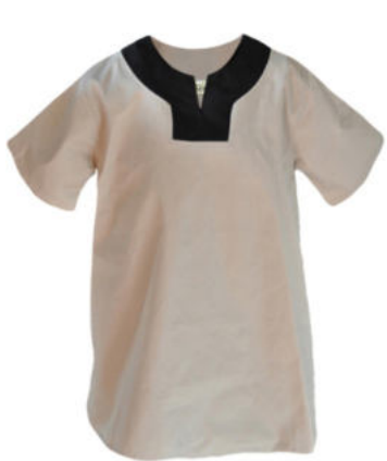
AT780 - UNISEX TUNIC SS - from R210.00