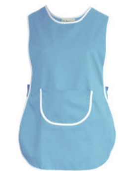
AXTOTAB - STANDARD TABARD CONTRAST BINDING - from R144.00

Manufactured to your colour and trim detail - wide choice of fabric types and weights. 5 - 6 week delivery • Shading may occur within stock garment orders due to varying fabric batches • See Stock Catalogue for immediate delivery • Rise per size • Excl VAT & Freight • T's & C's Apply