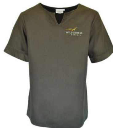
AT801 - UNISEX TUNIC SS - from R179.00