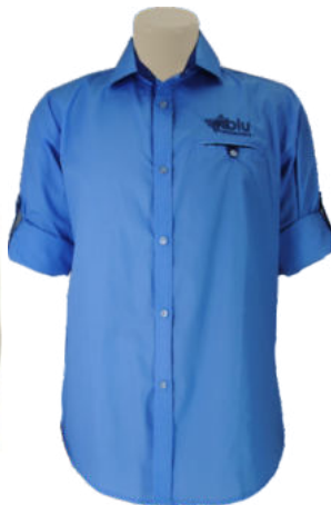
AT1037 - MENS SLIM FIT LOUNGE SHIRT LS - from R328.00