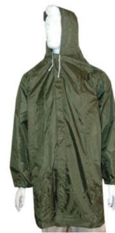
AXTMRAINCOAT - RAINCOAT IN A BAG - 1 PIECE - from R190.00