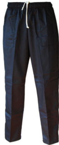
EP11 - BLACK - UNISEX ELASTICATED PANTS WITH PKTS & DRAWCORD - from R193.00