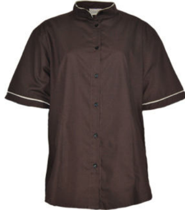
AT729B - LADIES BUTTONUP MANDARIN COLLAR SHIRT SS - from R334.00