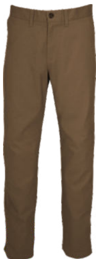
AS857-235 - STOCK 'CLASSIC ORIGINALS' MENS FLAT FRONT CHINOS - STONE, KHAKI & OAK - from R293.00