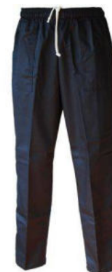
EP11 - BLACK - UNISEX BLACK ELASTICATED PANTS WITH PKTS - from R193.80