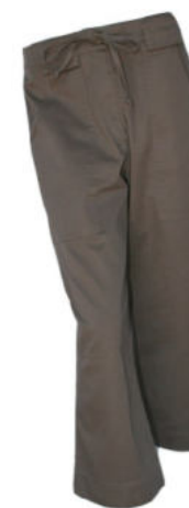
AT014 - LADIES DRAWSTRING CAPRI PANTS - from R227.00