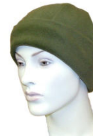
AT001 - POLAR FLEECE BEANIE from R75.00