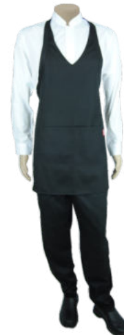
EC41A - V-NECK TUXEDO APRON from R215.00