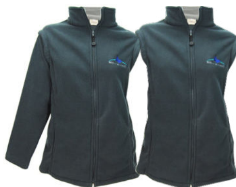
AT1008D - LDS PF ZIP-OFF SLV WITH PKTS - from R386.00