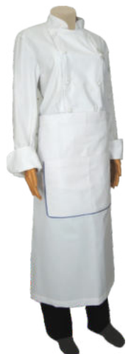
AT1076 - HALF APRON WITH PIPED POCKET from R162.00

Manufactured to your colour and trim detail - wide choice of fabric types and weights. 5 - 6 week delivery • Shading may occur within stock garment orders due to varying fabric batches • See Stock Catalogue for immediate delivery • Rise per size • Excl VAT & Freight • T's & C's Apply