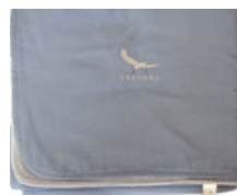
LUXURY BUSH BLANKET AT456A - 145 X 145CM - from R294.00 AT456B - 145 X 200CM - from R375.00 PC TWILL & POLAR FLEECE