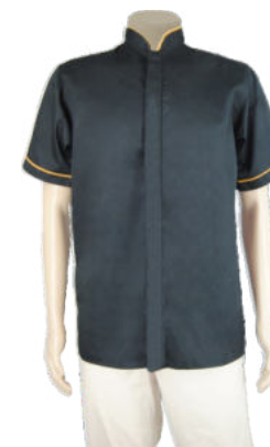
AT1004SS - MENS MANDARIN OPEN COLLAR SHIRT SS WITH COVERED BUTTONSTAND - from R274.00