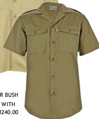
AXTOBSSE - TRACKER BUSH SHIRT GLADNECK SS WITH EPAULETTES - from R212.00