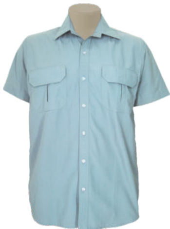
AT370SBV - MENS VENTED BUSH SHIRT LS - from R369.00 SS- from R353.00