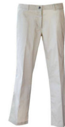
AS747B - LADIES STONE MID RISE FLAT FRONT TROUSERS from R297.00