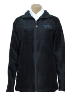
AT1008A - LADIES POLAR FLEECE TOP, RAGLAN SLEEVE, NO PKTS TOP - from R263.00

Manufactured to your colour and trim detail - wide choice of fabric types and weights. 5 - 6 week delivery • Shading may occur within stock garment orders due to varying fabric batches • See Stock Catalogue for immediate delivery • Rise per size • Excl VAT & Freight • T's & C's Apply