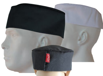
EP6 CHEFS BEANIE WITH TONAL TOPPIPING AND HIDDEN VELCRO CLOSER 7,5H X 18Dcm • BLACK • WHITE