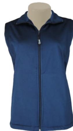
AT1059B - LADIES SOFT SHELL JACKET SLEEVELESS WITH PKTS - from R373.00