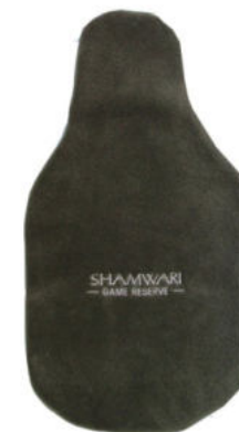
AT453 - HOT WATERBOTTLE cover - from R64.00