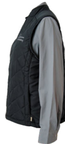
AT737C - LADIES QUILTED S/LESS JACKET WITH SIDE PANELS - from R497.00