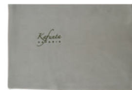
PF BLANKET RAW CUT EDGE AT454F - 140 X 100 - from R79.00 AT454E - 140 X 150 - from R118.00 AT454G - 140 X 200 - from R150.00