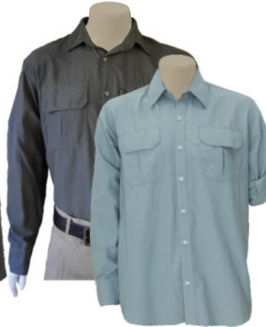
AT971SS - MENS SS TECH SHIRT WITH BACK VENT from R443.00