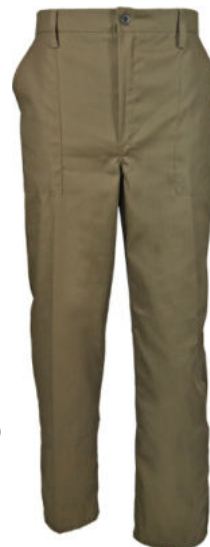
AXTOPAN - TRACKER PANTS WITH FLY AND HALF ELASTICATED - from R209.00