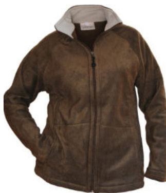
AT1008 - LDS PF TOP, RAGLAN SLV WITH PKTS - from R290.00