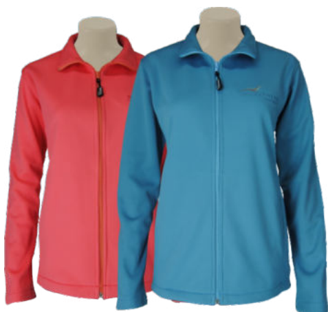
AT1059 - LADIES SOFT SHELL JACKET WITH PKTS - from R433.00