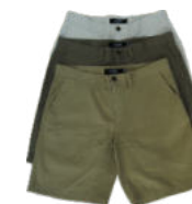
AS856CH - INNER LEG 21cm from R309.00