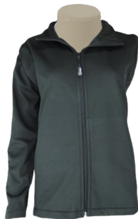
AT1059C - LADIES SOFT SHELL JACKET WITH ZIP-OFF SLEEVES AND PKTS - from R492.00