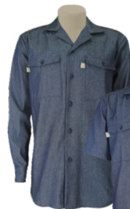
AXTOBLS-DEN DENIM SHIRT LS - from R259.00