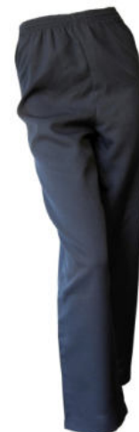
AT987 - LADIES ELASTICATED PANTS - from R140.00