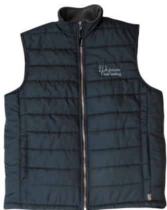
AT397 - MENS RIGID SLEEVELESS PUFFER JACKET - from R433.00