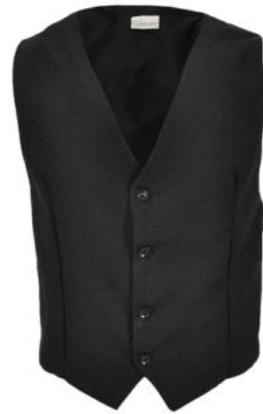
AT870 - UNISEX WAISTCOAT FULLY LINED - from R304.00