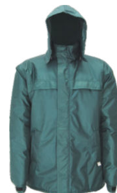
AS1069G - JACKET WR WARM QUILTED PADDED LINING AND FOLD-IN HOOD - BOTTLE GREEN - from R514.00 Fabric: Oxford Nylon WP Size: S - 3XL