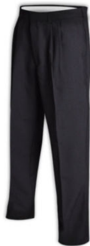
AXCM-TG1-460 - MENS SERVICE STAFF POLY TROUSERS - from R295.00