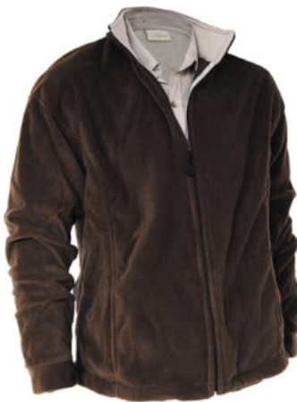
AS283 - STOCK - MENS PF TOP WITH POCKETS - from R287.00