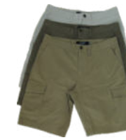
AS856BC - INNER LEG 26cm from R357.00

Shading may occur within stock garment orders due to varying fabric batches