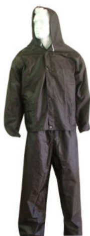
AXTMRAINSUIT - RAINSUIT IN A BAG - 2 PIECE - from R224.00