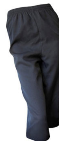
AT987B - LADIES 3/4 COMFORT PULL ON PANTS POLYESTER - from R132.00

Manufactured to your colour and trim detail - wide choice of fabric types and weights. 5 - 6 week delivery • Shading may occur within stock garment orders due to varying fabric batches • See Stock Catalogue for immediate delivery • Rise per size • Excl VAT & Freight • T's & C's Apply