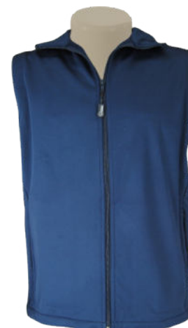
AT1058B - MENS SOFTSHELL JACKET SLEEVELESS WITH PKTS - from R396.00