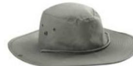
AXCYBUSHHAT - BUSH HAT WITH SIDE STUDS, SOFT WIDE BRIM AND NECK CORD - from R97.00