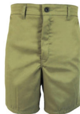
AXTOSHO - TRACKER SHORTS WITH FLY AND HALF ELASTICATED - from R142.00