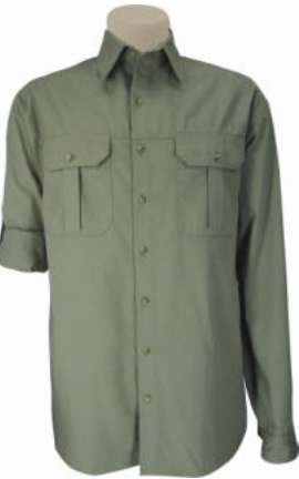
AS047-235 - STOCK - HEAVY COTTON 'CLASSIC ORIGINALS' BUSH SHIRT SS, KHAKI - from R296.00