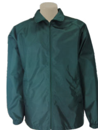
AT1070 - WINDBREAKER BASIC UNLINED WITH A FOLD-IN HOOD - from R294.00