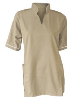
AT966 - LADIES SS V NECKLINE SERVICE TUNIC - from R202.00