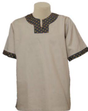
AT780C - UNISEX TUNIC SS WITH SHWESHE NECK & SLEEVE TRIM - from R263.00