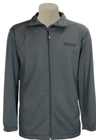
AT1058 - MENS SOFTSHELL JACKET WITH PKTS - from R433.00