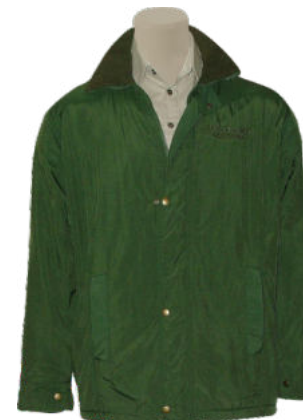
AT817 - MENS JACKET WITH PF LINING & SLANT POCKETS - from R602.00