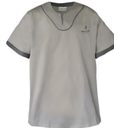
AT780E - UNISEX TUNIC SS WITH PIPING & SLEEVE TRIM - from R238.00