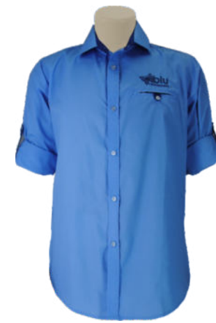
AT1037 - POLYCOTTON SLIM FIT LOUNGE SHIRT LS - from R328.00