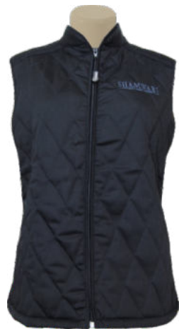
AT737B - LADIES L/LENGTH QUILTED S/LESS JACKET POLYLINED - from R467.00