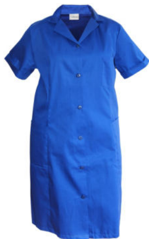
AXTOSMS - LADIES SMOCK STANDARD - 106CM FROM NECK TO SEAM - from R199.00