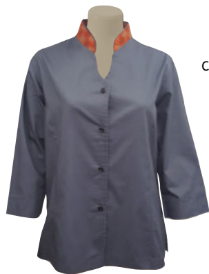
AT1063SS - LADIES OPEN MANDARIN COLLAR SHIRT SS COVERED BUTTON STAND - from R272.00