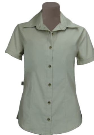
AT150B - LDS CLASSIC SHAPED SS SHIRT from R242.00