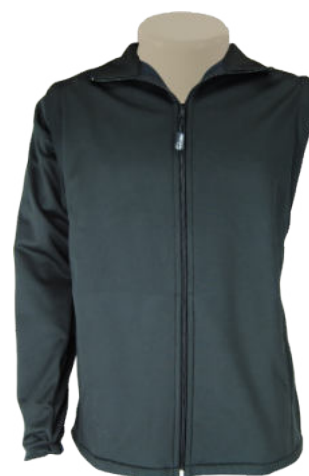
AT1058C - MENS SOFTSHELL JACKET ZIP-OFF SLVS WITH PKTS - from R539.00