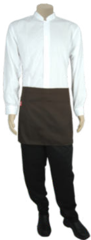
EC33A - BAR APRON WITH POCKET AND OPTIONAL STRIPES - from R119.00