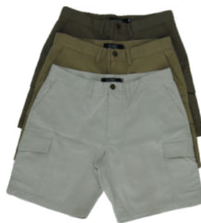
AT856CAR - MENS FLAT FRONT CARGO CHINO SHORTS - from R327.00