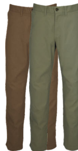
AS857-235 - STOCK 'CLASSIC ORIGINALS' MENS FLAT FRONT CHINOS • Premier brand at wholesale pricing • Washed & brushed 100% cotton twill • Back jet pocket • YKK Zipper • SABS quality fabric Size: Men 30 - 44 - from R293.00