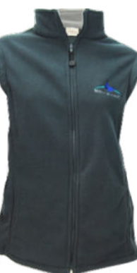
AT1008C - LDS PF SLVLESS TOP WITH PKTS - from R264.00