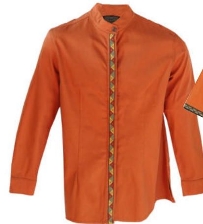
AT159E - LADIES MANDARIN COLLAR BUTTONUP SHIRT, LS COVERED B/S OPT PKTS & TRIM - from R384.00