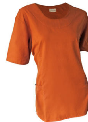
AT962 - LADIES ROUND NECK REAR ZIPTUNIC - from R250.00