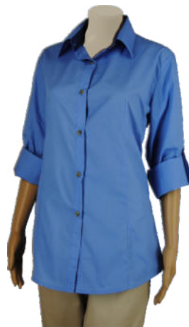
AT150 - LDS CLASSIC SHAPED LS SHIRT WITH SLV TAB - from R263.00