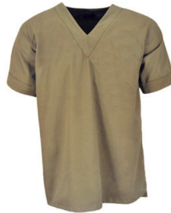
AT155 - UNISEX V-NECK TUNIC SS - from R220.00