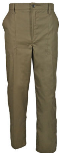
AXTOPAN PANTS WITH FLY AND HALF ELASTICATED - from R209.00