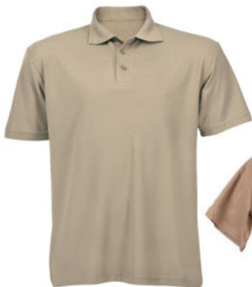
AXKVLAS175B - MENS BASIC POLYCOTTON GOLFER - from R105.00