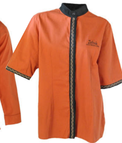
AT159D - LADIES MANDARIN COLLAR BUTTONUP SHIRT SS OPT PKTS AND TRIM - from R285.00