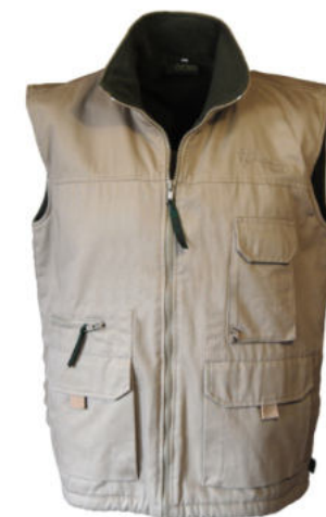
AT163BA - MENS DELUXE SLEEVELESS JACKET PF LINED - from R554.00

Manufactured to your colour and trim detail - wide choice of fabric types and weights. 5 - 6 week delivery • Shading may occur within stock garment orders due to varying fabric batches • See Stock Catalogue for immediate delivery • Rise per size • Excl VAT & Freight • T's & C's Apply