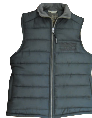
AT1074 - LADIES FITTED RIGID PUFFER JACKET WITH PKTS - from R432.00

Manufactured to your colour and trim detail - wide choice of fabric types and weights. 5 - 6 week delivery • Shading may occur within stock garment orders due to varying fabric batches • See Stock Catalogue for immediate delivery • Rise per size • Excl VAT & Freight • T's & C's Apply