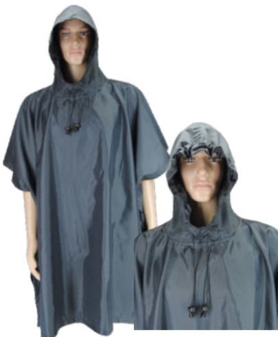
AT566F - PONCHO CLOSED NECK UNLINED KNEE LENGTH - from R311.00 WP OXFORD NYLON