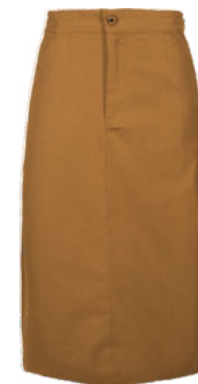
AXTO40 - LADIES HALF ELASTICATED SKIRT WITH BUTTON & ZIP - from R197.00