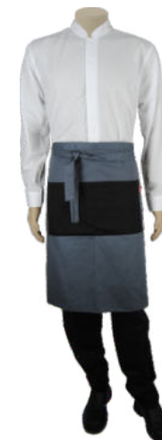
AT1048 - BISTRO CONTRAST HALF APRON from R104.00