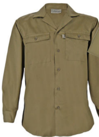
AXTOBLS - TRACKER BUSH SHIRT GLADNECK LS - from R227.00