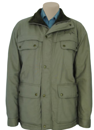
PARKA JACKET WITH PF LINING & FOUR POCKETS AT395-210 - from R1041.00 AT395-235 - from R1054.00