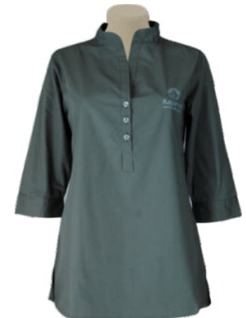
AT1047 - LADIES 3/4 SLEEVE SHIRT 1/4 B/S - from R246.00

Manufactured to your colour and trim detail - wide choice of fabric types and weights. 5 - 6 week delivery • Shading may occur within stock garment orders due to varying fabric batches • See Stock Catalogue for immediate delivery • Rise per size • Excl VAT & Freight • T's & C's Apply