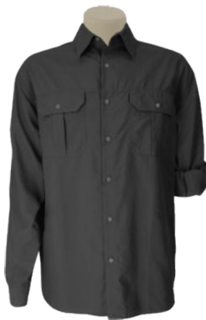
AS044-TEC - STOCK - RANGERS BUSH SHIRT WITH ROLL UP TABS LS OLIVE, STONE OR CHOC - from R416.00