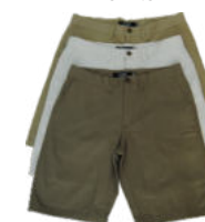
AS856BE - INNER LEG 26cm from R309.00