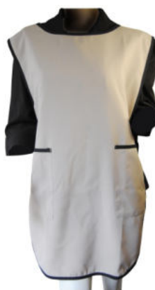
AT985 - SPA TABARD - LONGER LENGTH WITH TWO FRONT SIDE POCKETS AND SIDE TIES - from R186.00

- LADIES FORMAL MIDRISE BOOTLEG PANTS POLYESTER - from R231.00