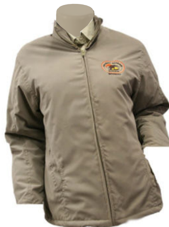
AT502 - LADIES PADDED JACKET - from R591.00