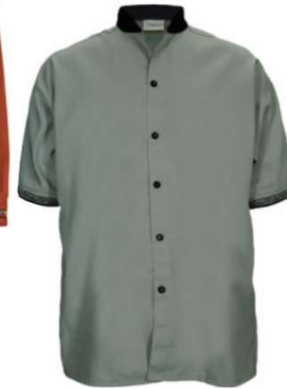
AT159B - MENS MANDARIN COLLAR SS SHIRT WITH OPT PKTS & TRIM - from R268.00