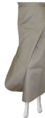
AT070 - LADIES PLAIN WRAP SKIRT, 1 PANEL - from R161.00