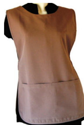
AT833B - SPA TABARD - LONGER LENGTH, SIDE BUTTON CLOSURES FULL FRONT DOUBLE PKT - from R246.00