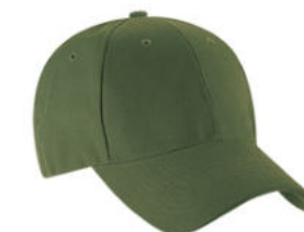
AXCY6PANWORK 6 PANEL DURABLE WORKWEAR CAP - from R42.00