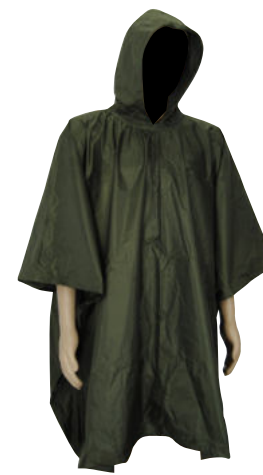
ASTMPONC - PONCHO - DURABLE RUBBERISED AND WATERPROOF, CHOCOLATE, 1,2M LONG - from R239.00 Fabric: Nylon - Size: OSFA ASTMPONO - OLIVE - from R239.00