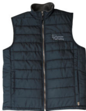
AT397 - MENS SLEEVELESS RIGID PUFFER JACKET - from R433.00