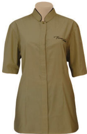
AT1063SS - LADIES OPEN MANDARIN COLLAR SHIRT SS COVERED B/S - from R272.00