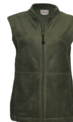
AT026C - LADIES FITTED SLEEVELESS POLAR FLEECE TOP - from R264.00