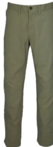
AS857-235 - STOCK 'CLASSIC ORIGINALS' MENS FLAT FRONT CHINOS, OLIVE, STONE & OAK - from R293.00