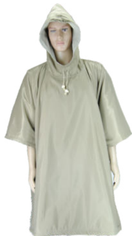
AT566E - PONCHO CLOSED NECK PF LINED KNEE LENGTH - from R544.00 WP OXFORD NYLON & POLAR FLEECE