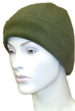
AT001 - POLAR FLEECE BEANIE - from R75.00