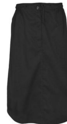
AT064B - LADIES COMFORTABLE SKIRT - - from R190.00