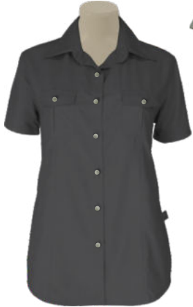
AS150F-TECH - STOCK - LADIES BUSH SHIRT SHAPED WITH FLAP PKTS SS, STONE, OLIVE & CHOCOLATE - from R288.00