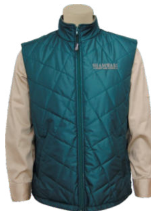
AT397B - MENS SLEEVELESS PUFFER JACKET WITH DIAMOND STITCHING - from R421.00