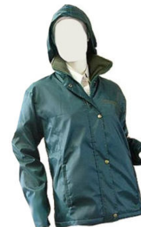
AT813 - LADIES CLASSIC JACKET WITH POLAR FLEECE LINING - from R572.00