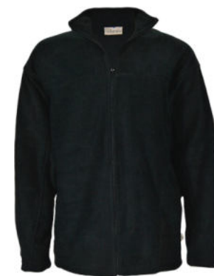
AS283AB - STOCK UNISEX PF TOP, NO POCKETS BLACK - from R238.00

Manufactured to your colour and trim detail - wide choice of fabric types and weights. 5 - 6 week delivery • Shading may occur within stock garment orders due to varying fabric batches • See Stock Catalogue for immediate delivery • Rise per size • Excl VAT & Freight • T's & C's Apply