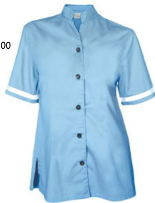
AT159 - LADIES OPEN NECK SHIRT SS OPT PKTS AND TRIM - from R263.00