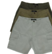
AS856CC - INNER LEG 21cm from R357.00