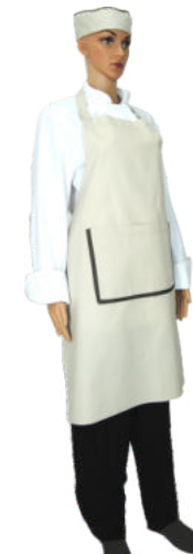
EC9A-B - FULL APRON WITH SQUARE PIPED POCKET - from R152.00