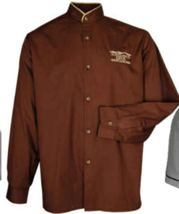
AT371B - MENS MANDARIN COLLAR SHIRT LS - from R314.00