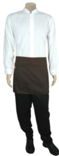
AXTO33 - BAR APRON - FRONT POCKET - from R64.00