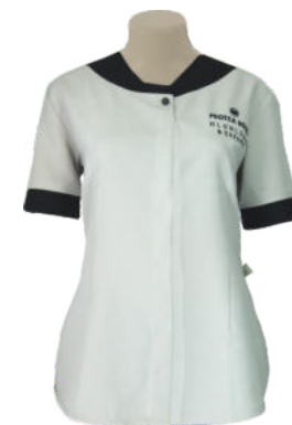
AT1067 - LADIES ROUNDED NECK SS SHAPED - from R242.00