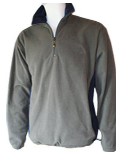
AT283B - UNISEX 1/4 ZIP PF TOP WITH SIDE PANELS - from R272.00