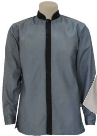
AT1004LS - MENS MANDARIN OPEN NECK COLLAR, COVERED BUTTONSTAND SHIRT LS - from R328.00 - SS - from R274.00