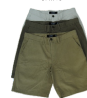
AS856CH - INNER LEG 21cm from R309.00