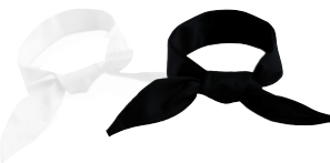
EP7 - BANDANNA OR DOEK, TRIANGULAR 100 X 70 X 70cm