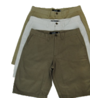
AS856BE - INNER LEG 26cm from R309.00