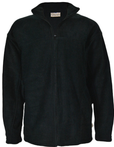
UNISEX POLAR FLEECE TOP - NO POCKETS AS283AB - BLACK from R238.00 Fabric: Normal Polar Fleece Size: XS - 3XL