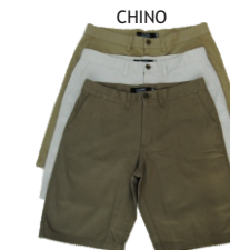
AS856BE - INNER LEG 26cm from R305.00