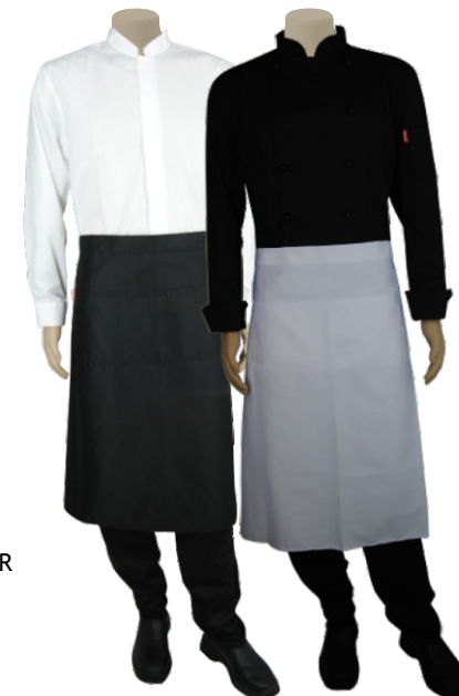
ES2B EXECUTIVE CHEFS JACKET WITH PIPING, FRENCH CUFFS & UNDERARM EYELETS ES2BWB - WHITE WITH BLACK PIPING ES2BBW - BLACK WITH WHITE PIPING