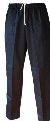
EP11 - BLACK - UNISEX BLACK ELASTICATED PANTS WITH PKTS - from R193.80