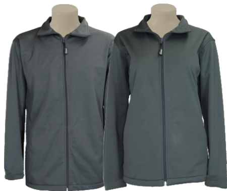
SOFTSHELL JACKET WITH POCKETS - GREY