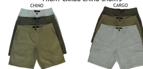
AS856CH - INNER LEG 21cm from R305.00