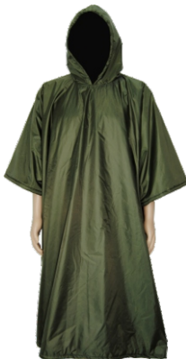
ASTMPLIO - ADULTS LINED PONCHO