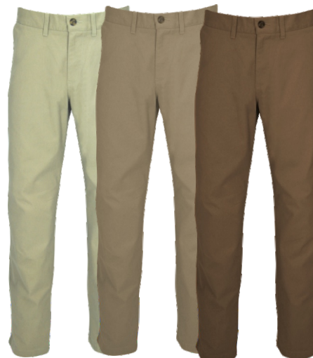
AS857-235 - from R289.00 'CLASSIC ORIGINALS' MENS FLAT FRONT CHINOS Premier brand at wholesale pricing Washed & brushed 100% cotton twill Back jet pocket YKK Zipper SABS quality fabric Size: Men 30 - 44