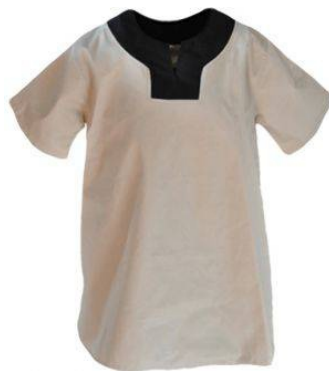
AS780 - UNISEX STONE AND BLACK TUNIC SHIRT SS - SERVICE STAFF from R244.05 Fabric: 210G Polycotton Twill Size: Generic XS - 3XL