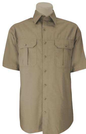
AS047-235 - from R267.07

"CLASSIC ORIGINALS" MENS BUSH SHIRT KHAKI ONLY 235g BRUSHED COTTON TWILL Size: S - 3XL