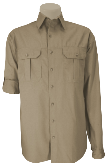
AS044-235 - from R310.01

By making this purchase you are directly supporting our training programs and empowering our community