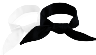
EP7 - BANDANNA OR DOEK, TRIANGULAR 100 X 70 X 70cm • BLACK • WHITE