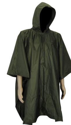
ASTMPONCHO - PONCHO - DURABLE RUBBERISED AND WATERPROOF, OLIVE & CHOCOLATE - from R225.23 Fabric: Nylon Size: OSFA