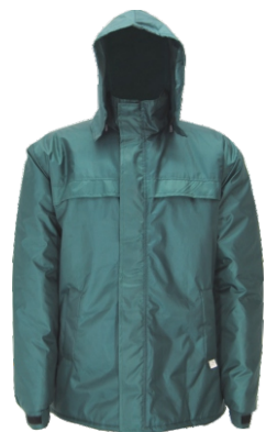
ASTM-ATC1-OXN - JACKET WR WARM QUILTED PADDED LINING AND FOLD-IN HOOD BOTTLE GREEN - from R460.71 Fabric: Oxford Nylon WP Size: Generic S - 3XL