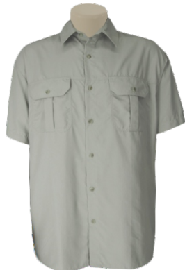
MENS BUSH SHIRT WITH FLAP POCKETS Size: S - 3XL