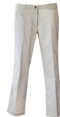
AS747B - LADIES STONE MID RISE FLAT FRONT TROUSERS from R271.86 Fabric: 210G Polycotton Twill Size: Ladies 30 - 42