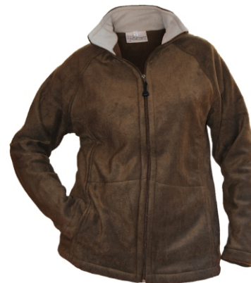
AS1008BASE - LADIES PF TOP, RAGLAN SLV, PKTS, CHOCOLATE / MUSHROOM from R256.28 Fabric: Normal Polar Fleece Size: Generic XS - 2XL