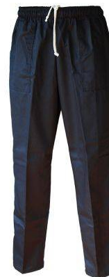
EP11 - BLACK - UNISEX BLACK ELASTICATED PANTS WITH PKTS from R180.20 Fabric: Polycotton Twill Size: Generic S - 5XL