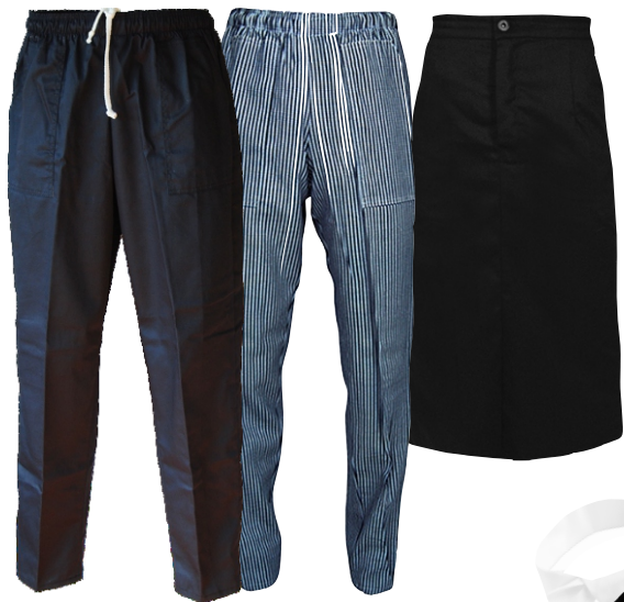
EP40 LADIES HALF ELASTICATED SKIRT WITH BUTTON & ZIP • BLACK